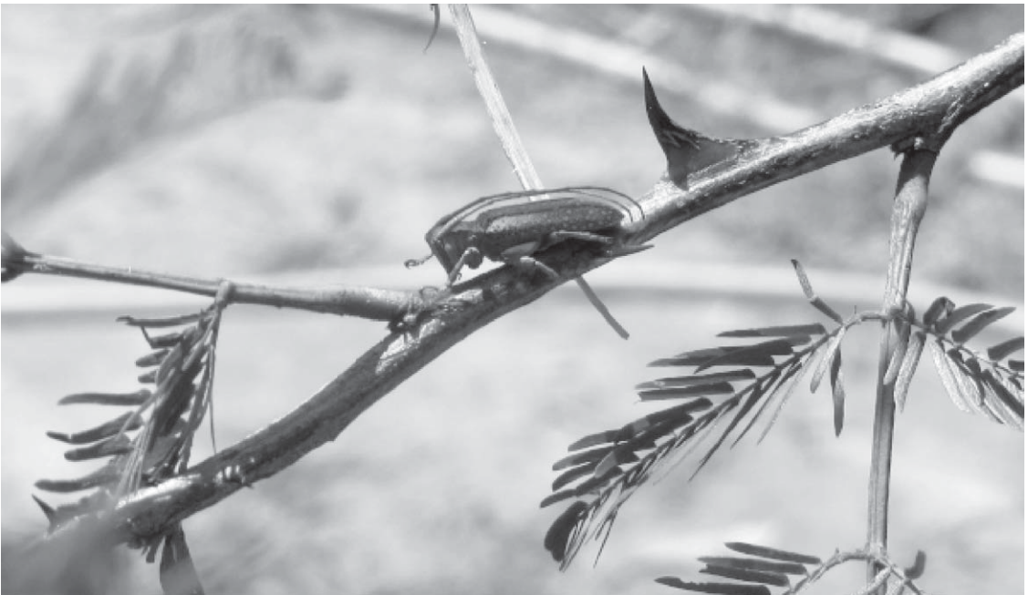
Fig. 1. Oncideres ocularis Thomson, 1868 on a branch of Mimosa bimucronata (DC.) Kuntze.

Weekly visits were made from Dec 2010 to Apr 2011 and Dec 2011 to Apr 2012 to collect fallen branches girdled by this beetle. The diam of the portion where the branches were girdled was measured with a digital caliper with an accuracy of 0.01 mm and its length measured with tape with an accuracy of 0.1 mm. The number of egg-laying incisions was counted per branch. The length of the branch was divided into 5 equal sections (basal, mid-basal, middle, mid-apical and