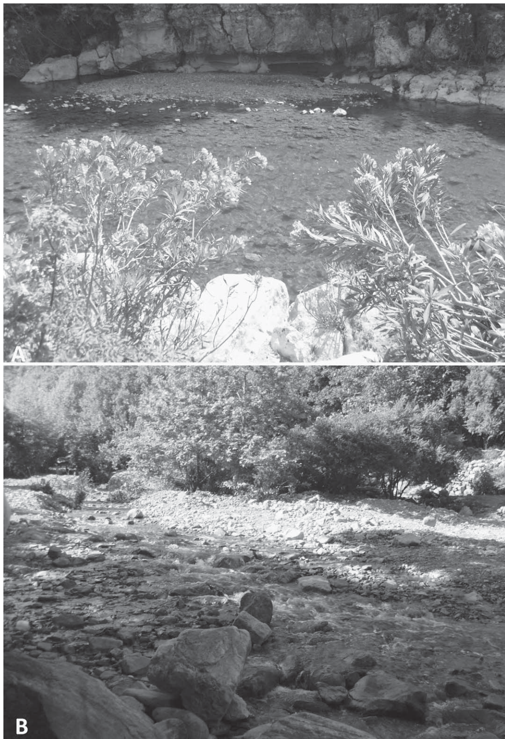
Fig. 1. Collection locations of Perileptus ; (A) Amanos Mountains, Hatay Province, Sinanlı, Karaçay, and (B) Amanos Mountains, Hatay Province, Hassa, Demrek. This figure is displayed in color online in supplementary material for this article in Florida Entomologist 97(4) (December 2014) at http://purl.fcla.edu/fcla/entomologist/browse .