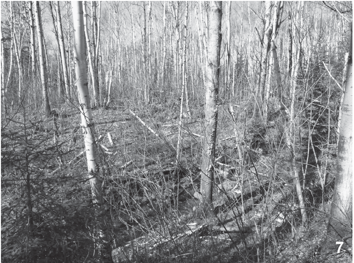
Fig. 7. Habitat of Galanura agnieskae in Quebec, Canada.

tebellingeri , 3+3 in others), number of ordinary chaetae De on abd. V (6 in P. saproxylica , 5 in P. anops , 4 in P. petebellingeri ), number of chaetae on ventral tube (5+5 in P. saproxylica , 4+4 in P. petebellingeri , unknown in P. anops ), number of microchaetae on furca remnant (4+4 in P. saproxylica , 3+3 in others), number of trochanteral chaetae (6 in P. saproxylica , 5 P. petebellingeri , unknown in P. anops ).