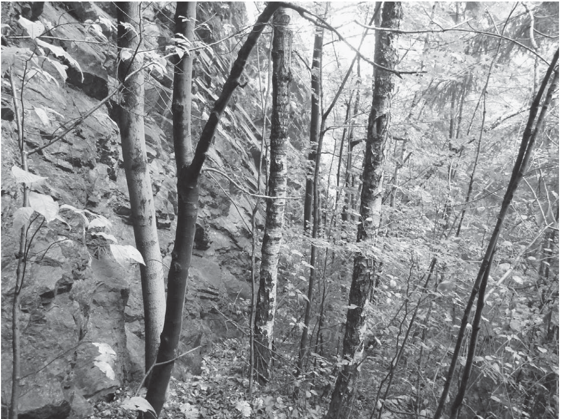
Fig. 8. Habitat of Galanura agnieskae in Poland (locus typicus).

stumps have a much smaller diam. Moreover, the rate of decay of these hardwoods is several times faster than that of coniferous trees in the area. This means that populations of Xylanura are forced to move between the stumps far more often than those species living in coniferous logs. In addition, deciduous species in the area are much harder to find and can be found mostly in along stream channels and disturbed places affected by anthropogenic or natural factors such as landslides or avalanches (Franklin & Dyrness 1988).