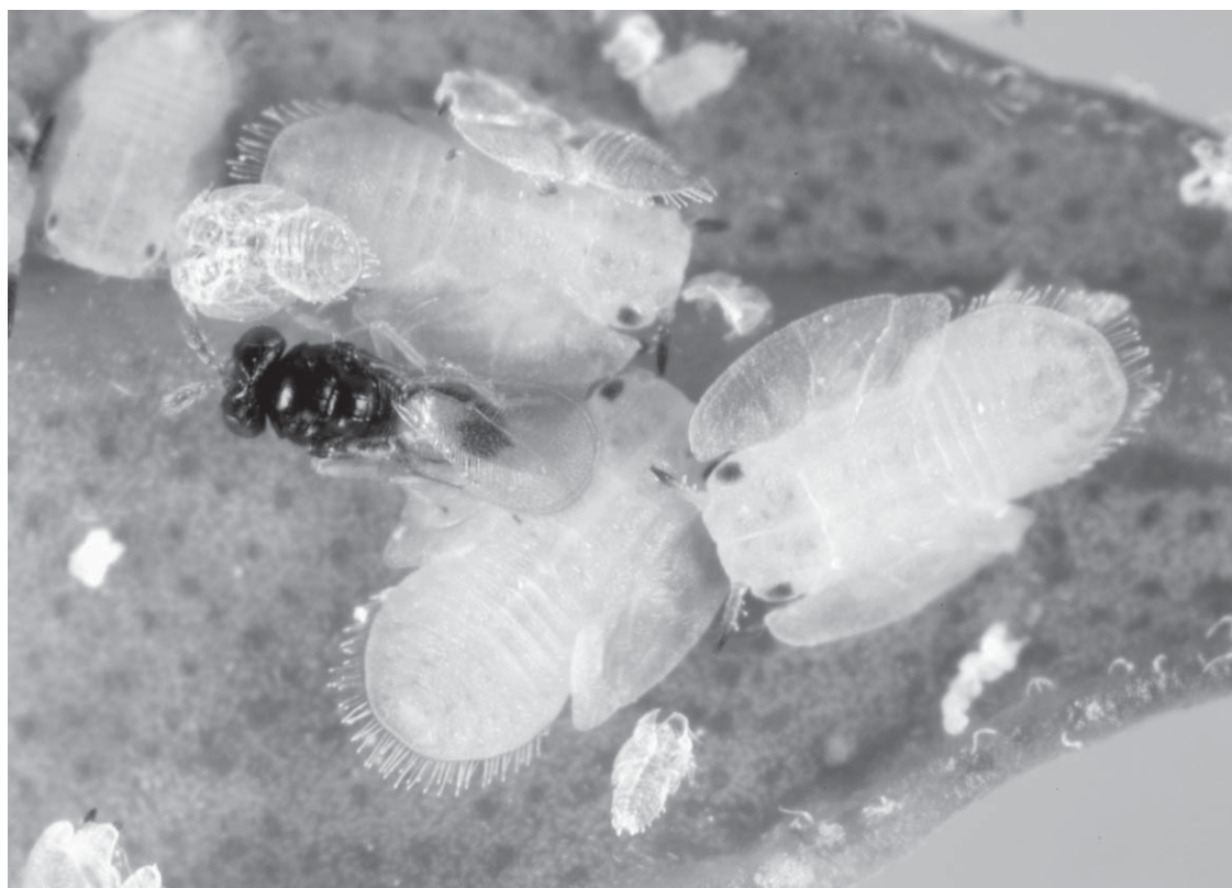
Fig. 1. Female Tamarixia radiata ovipositing into an early 5th instar Diaphorina citri nymph.

Male and female are the similar in color and body structure, except for antennae and a some-