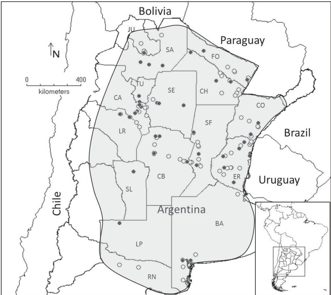
Fig. 2. Distribution of Apanteles opuntiarum which emerged from Cactoblastis cactorum larvae (black circles) and locations where A. opuntiarum did not emerge from C. cactorum larvae (white circles) collected in the Argentina provinces of Buenos Aires (BA), Catamarca (CA), Córdoba (CB), Chaco (CH), Corrientes (CO), Entre Ríos (ER), Formosa (FO), Jujuy (JU), La Pampa (LP), La Rioja (LR), Río Negro (RN), Salta (SA), Santiago del Estero (SE), Santa Fe (SF), San Luis (SL), and Tucumán (TU). Shaded area indicates surveyed region.

conditions, such as host and parasitoid densities, and source of the females. The highest success was obtained with 30 host larvae exposed to parasitism by two field-collected female wasps. Increasing host larval numbers ( n = 50 ) did not translate into higher reproductive success, and decreasing host larval numbers ( n = 10 ) negatively impacted the reproductive success of A. opuntiarum . At this lowest density, many host larvae died in earliest instar stages, probably because of superparasitism or numerous stings. Although field-collected females had a similar attack rate as laboratory-reared females, the former produced a greater number of offspring and produced both males and females, essential to the continuity of a laboratory culture.