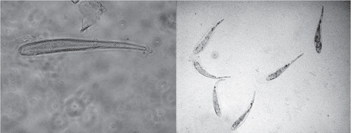
Fig. 3. Oocytes of Apanteles opuntiarum obtained by dissecting females soon after emergence. Left: 400 x, right: 100 x.

strain ( A. opuntiarum is not thelytokous, while there is evidence of parthenogenesis induction by Wolbachia in Naupactini weevils, M. R unpublished data). Whether or not this strain is inducing cytoplasmic incompatibility in A. opuntiarum is still unknown and a subject of future research in order to see if Wolbachia is the cause of the male-biased rearing problem.