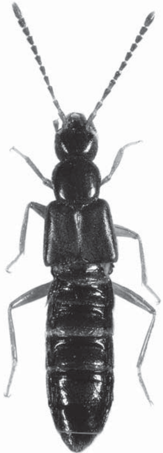
Fig. 1. Habitus of Aloconota elongata sp. nov. , 4.1 mm.

Length 4.0-4.5 mm. Body large, parallel-sided; surface glossy, densely pubescent with microsculpture (Fig. 1). Body usually dark brown to black; basal antennomeres, mouthparts and legs paler brown; head and abdomen slightly darker than pronotum and elytra. Head . Slightly elongate, approximately 1.1 times longer than wide, slightly narrower than pronotum; eyes slightly prominent, about 1.4-1.5 times as long as tempora; gular sutures moderately separated, dilated basally; infraorbital carina incomplete; cervical carina forked. Antennae (Fig. 7) long and