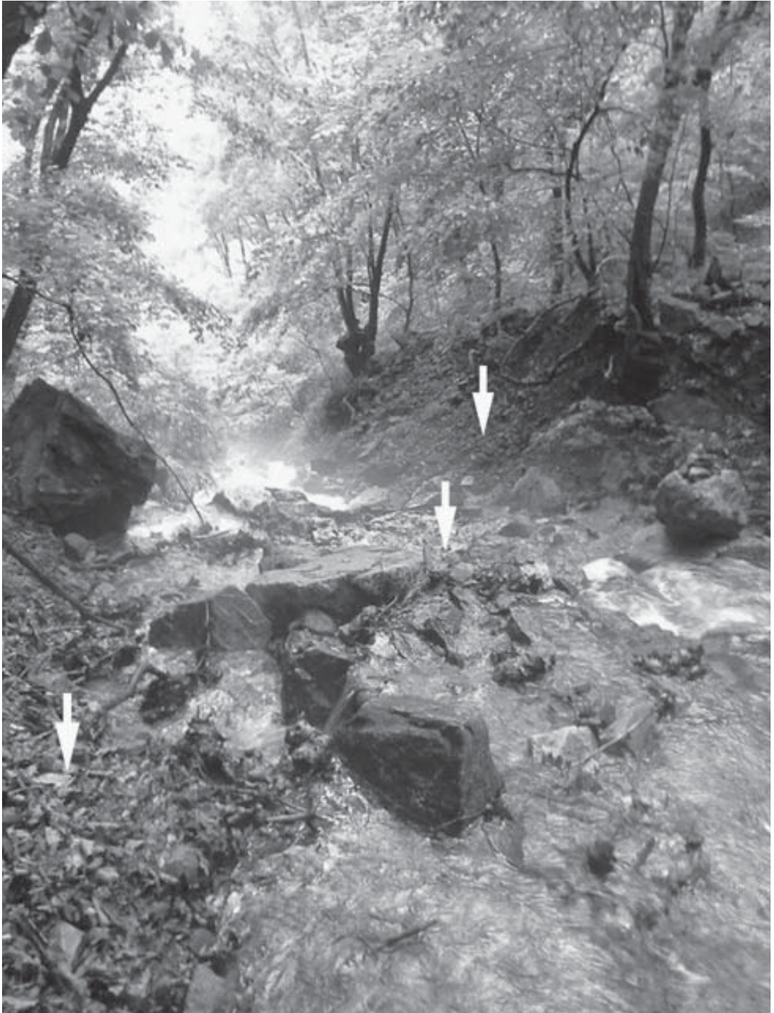
Fig. 15. The type locality of Aloconota elongata sp. nov. , mountain stream at Mt. Jirisan, Gurye-gun, Korea. This species were found under stones and flood debris near stream of this photograph.