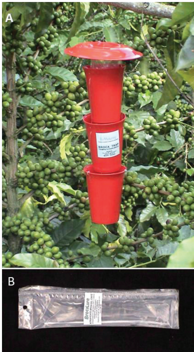
Fig. 1. A red funnel trap used to capture CBB ( Hypothenemus hampei ) (A) and the methanol-ethanol lure (3: 1 ratio) enclosed in a semi-permeable membrane (B). CBB were collected in a plastic container containing 200 mL of soapy water.

populations declined through the smaller harvest (Mar–Jun). Fewer CBB were collected in the small coffee farms (Viterbo) (averages of 38 to 105 CBB per trap/week), however, a similar seasonal trend was observed, with captures peaking from Jan–Mar (Fig. 2B). The start of the peak flight activity on smaller farms (Jan) again correlated with higher berry infestation (> 2.5%), and dropped later in the year as flight activity declined. A positive linear correlation (Pearson coefficient) between number of CBB captured and percent berry infestation was observed for both large ( r^2 = 0.90 ) and small ( r^2 = 0.68 ) farms. A similar relationship was reported by Pereira et al. (2012) in Brazil. However, their regression model could not determine an action threshold for CBB, since the intercept indicated that no CBB were caught at a low field infestation ( \approx 3 to 5% berry infestation), which was not observed in our study.