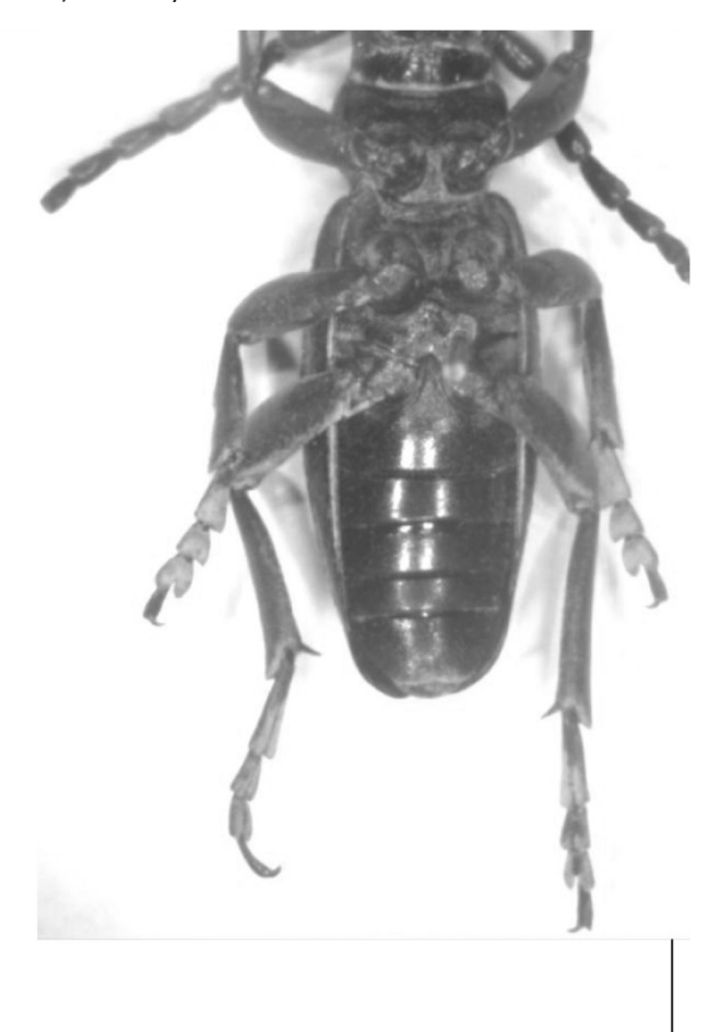
Fig. 2. Megalodorcadion nudefasciatum sp. nov. (paratype \delta ).