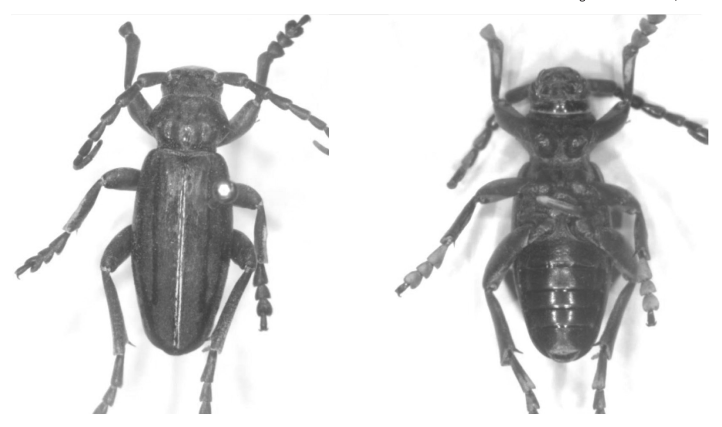
Fig. 1. Megalodorcadion nudefasciatum sp. nov. (holotype ♂).

Elytra with very dense, recumbent, dark-brown ground pubescence; each elytron with two glabrous bands as humeral and dorsal, and a distinct sutural band of white pubescence; glabrous bands complete; dorsal band separated from humeral band but joined at the end; elytra laterally glabrous; elytral apex without setae, flattened and rounded, reddish-brown.