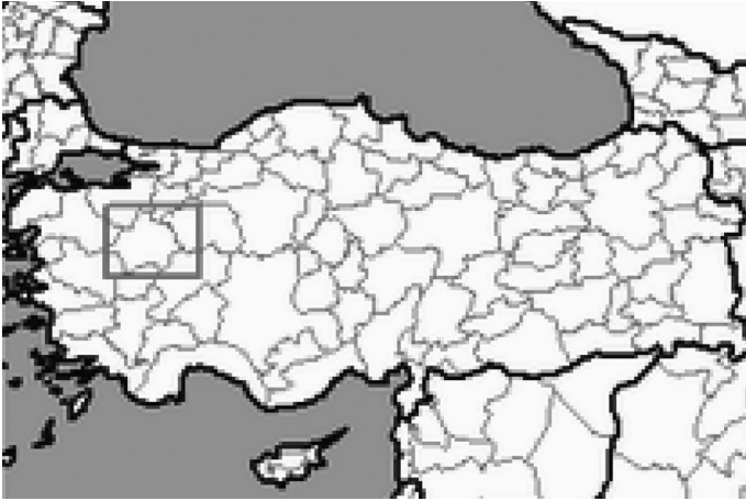
Fig. 3. Location of Kütahya province in Turkey.