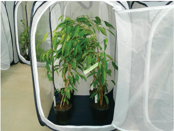
Fig. 2. Four Ficus benjamina plants inside a collapsible cage.