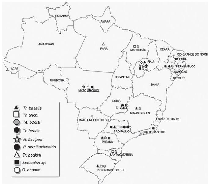
Fig. 2. Map of the known occurrence of the stink bug parasitoids Trissolcus basalis , Tr. urichi , Tr. teretis , Tr. bodkini , Telenomus podisi , Phanuropsis semiflaviventris , Neorileya flavipes , Ooencyrtus anasae , and Anastatus sp. in Brazil.