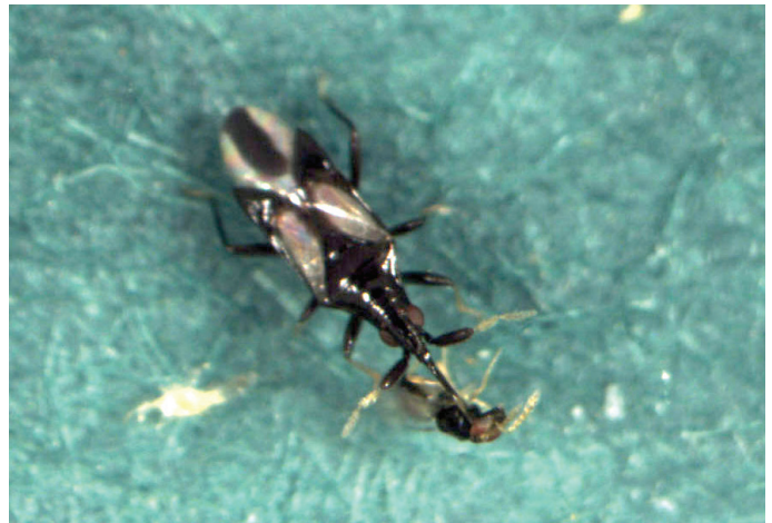
Fig. 3. Montandoniola confusa (Anthocoridae) attacking Thripistichus gentilei . This predator also feeds on the eggs and immature stages of Gynaikothrips species.