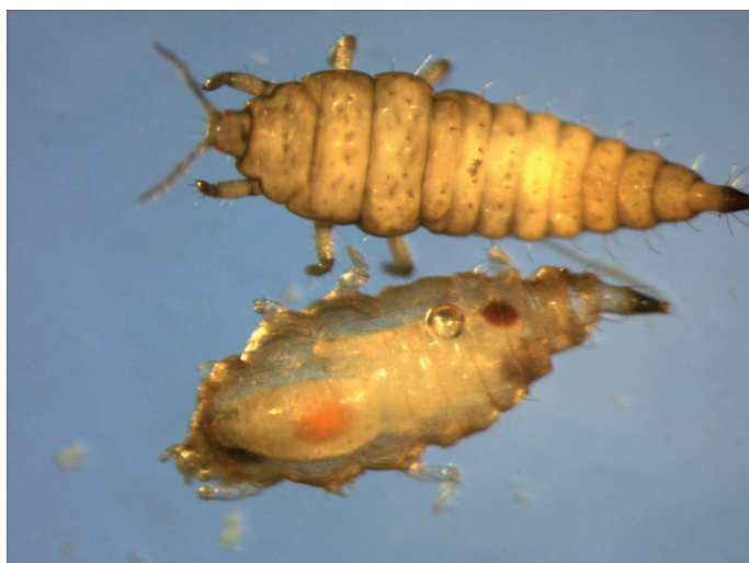
Fig. 1. Two immatures of Gynaikothrips uzeli : the upper individual is a normal larva, and the lower one displays the transparent, swollen appearance of a parasitized larva. The parasitoid, Thripastichus gentilei , develops with a polarity that is reverse relative to the host.

For experiments with T. gentilei , cuttings were sorted into replicates so that cuttings within a replicate had a similar number of eggs. Within a replicate, cuttings were randomly assigned a life stage treatment (1st instar, 2nd instar, prepupa, pupa I, and pupa II) similar to that of Tavares et al. (2013). To achieve uniform life stages, immatures were allowed to develop from eggs inside leaf galls to a certain stage; then all individuals not at that prescribed stage were destroyed. However,