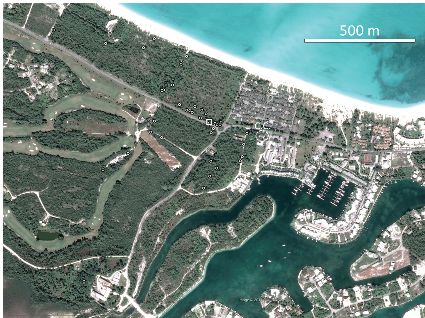
Fig. 2. Treasure Cay area, Abaco Island, The Bahamas infested by Nasutitermes corniger . Original 2005 N. corniger locality (white square), September 2015 live collection sites (black and white dots), and Treasure Cay Community Centre (C.C.). Imagery date: 31 Oct 2014, Google Earth®.

As with the Dania Beach, Florida, infestation (Scheffrahn et al. 2014), the mode and date of establishment of N. corniger on Treasure Cay, Abaco, cannot be determined. However, establishment by a dis-