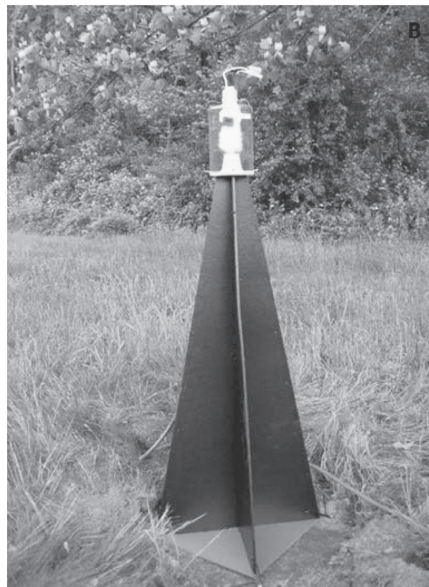
Fig. 1. Standard black pyramid trap with PHER lure (A) and modified pyramid trap with narrow blue fluorescent light (B).