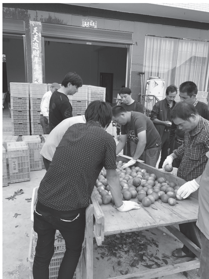
Fig. 2. Culling at local purchase station.