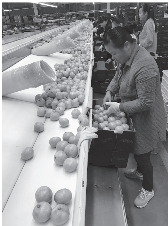
Fig. 3. Final packinghouse culling.

This reported work is just a beginning attempt to explore a systems approach for risk mitigation of fruit flies for citrus exports from China. A systems approach requires the use of 2 or more independent measures to achieve the goal of mitigation (FAO 2012). However, the 2 measures studied here, i.e., packinghouse culling and field fruit bagging, were effective for 2 different commodities, and under different production systems. To develop a systems approach for each of the commodities, more quantitative information regarding the efficacies of other risk mitigation measures along the pathway are needed. For Satsuma mandarins or other mandarin fruits, for example, what are the field practices that constitute a good pest management program? And what is the efficacy of this program, as well as the efficacies of other measures before the packinghouse in reducing the risk? For pomelos, what is the efficacy of shrink-wrapping for risk mitigation of fruit flies? Shrink-wrapping has been demonstrated as an effective measure for risk mitigation of fruit flies in other fresh fruits (Gould & Sharp 1990). Almost all pomelo fruits were shrink-wrapped in packinghouses in China. A combination of this packinghouse measure with the pre-harvest measure of fruit bagging can be a practical and economical systems approach for the pomelo trade.