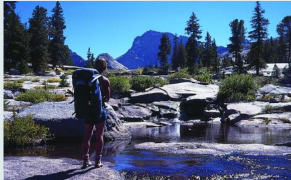
FIGURE 5 Climber approaching Deep Lake, with Temple Peak in the background.