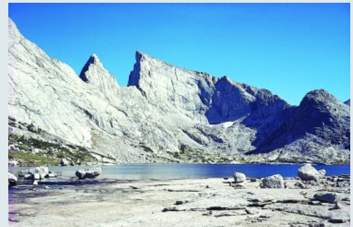
FIGURE 4 Deep Lake, East Temple, and Steeple Peaks, an area most attractive to climbers.

Widespread among environmentalists since John Muir is the unshakable conviction that