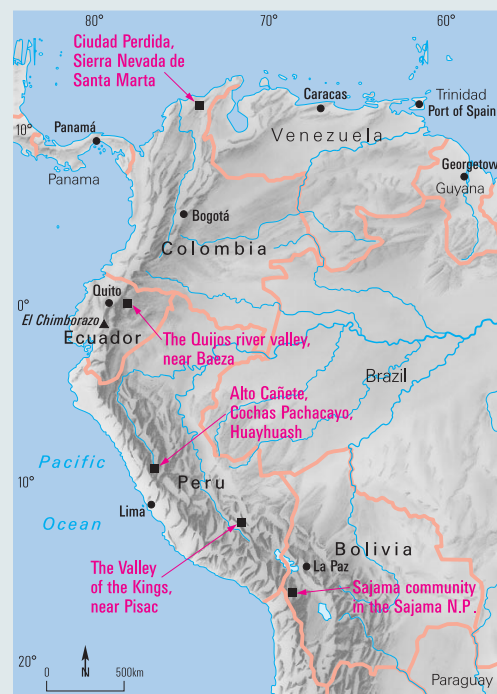
FIGURE 4 Location of 5 study sites on which the Ruta Cóndor/Wiracocha project draws in its attempt to link culturally and biologically important areas along the Andes. See also the article by Fausto Sarmiento et al., "Andean stewardship: Tradition linking nature and culture in Protected Landscapes of the Andes" in a special issue of The George Wright Forum (vol. 17.1, 2000). (Map by Andreas Brodbeck)

These sites, many of which are within or near currently protected areas, include examples of indigenous management, traditional agriculture, sacred sites, eco-tourism, and production alternatives. Each of these sites is rich in cultural and natural values and can be sustained only through the stewardship of local and indigenous communities (Figure 5). Over time, it is envisioned that the scope of the project will be expanded to encompass other cultural landscapes in Venezuela, Peru, Ecuador, and Chile. The Ruta Cóndor/Wiracocha project offers great potential to support the stewardship of Andean landscapes on a regional basis.