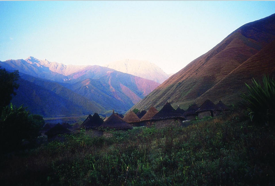
FIGURE 1 Indigenous village in the Sierra Nevada de Santa Marta. Working landscapes such as this require innovative approaches to conservation.

and requires new and innovative approaches to conservation. Emerging trends in conservation and protected areas management are creating new opportunities to engage local people in the stewardship of the natural and cultural heritage of working landscapes. This type of community-based approach builds on years of experience yet extends conservation strategies in new ways and holds great promise as a foundation for sustainable land stewardship.