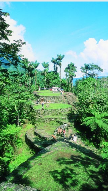
FIGURE 3 Ciudad Perdida, one of 300 archeological sites in the Sierra Nevada de Santa Marta, Colombia, offers an example of how human activity over time has shaped the landscape.

Experience with protected landscape conservation has also demonstrated that working with local communities is a critical component in the conservation strategy. The protected landscape approach has proven to work well in certain indigenous territories where strictly protected areas have failed, because it reinforces local responsibility for the area and accommodates traditional uses and customary tools for resource management. This can be of great importance in Andean countries, where the cultural landscapes provide evidence of the sophisticated systems of agriculture developed by indigenous societies to increase productivity in that complex environment. As Mujica argues, sustaining and restoring these cultural landscapes can therefore offer important opportunities for sustainable development of indigenous societies.