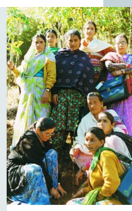
FIGURE 2 FECOFUN recognizes the key role of mountain women in natural resources management.

The ban on harvesting in community forests is a major issue. The government needs to understand that decisions related to community forests must be made by forest users. According to Nepalese law, community forests should be autonomous and self-governing; the government cannot dictate policy. If people are forbidden to do certain things, they will become discouraged and stop investing money and effort in community forests. I also find that bureaucrats are trying to blame user groups for forest mismanagement, and I get a clear feeling that they want the law to be changed to give them more power so they can interfere in community forests. I question the results achieved by the gov-