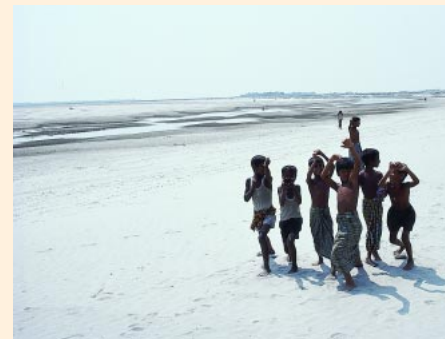
FIGURE 6 Very low discharge of the Brahmaputra/Jamuna River in the dry season leaves one channel of this mighty river almost entirely dry. It is hoped that dammed water resources in Nepal could supplement the periodically low water supplies in Bangladesh.

Water is an important issue in Bangladesh. More than 20% of Bangladesh is flooded in the monsoon season (Figure 5), although this figure varies extensively from year to year (eg, from 0.3% in 1994 to 67% in 1998). This widespread flooding is a recurrent problem for economic development, including food security. Water is often scarce in the dry season (Figure 6). Therefore, Bangladesh is interested in plans to construct high dams in Nepal to contain monsoon flow and increase dry-season discharge in the Ganges. However, recent research strongly suggests that Bangladeshi floods do not originate in the Himalayas but are the result of heavy rainfall within Bangladesh and neighboring areas in India and that dry-season discharge will not increase sub-