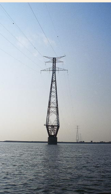
FIGURE 4 Electric power line crossing the Brahmaputra (Jamuna) River in Bangladesh. Such existing grids could be used to import hydropower from Nepal.

activity in rural areas, such as small-scale industry (Figure 3) and tourism. A hydropower project with a 100-kW capacity can potentially replace 100,000 L of kerosene annually if the electricity is used only for lighting. Inducing people to use electricity for cooking could reduce fuelwood consumption, and an additional effect would be gained from reducing smoke-related health problems. Due to small plant size, community participation in design and implementation is easier than with larger facilities and environmental aspects can more easily be incorporated. Guaranteeing sufficient low flow in the watercourse for downstream use and preserving resources such as fish are major concerns.