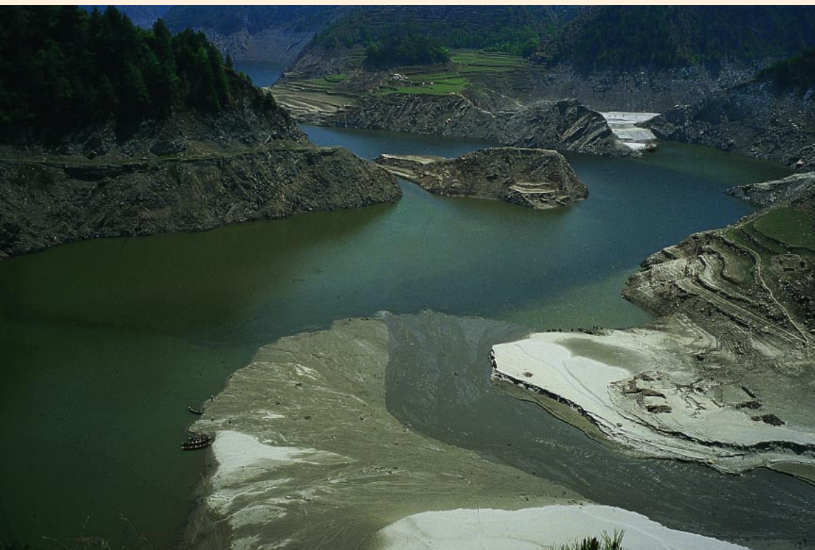
FIGURE 7 A single 30-hour stormburst in July 1993 scoured sediment off upstream mountainsides and deposited it in the Kulekhani reservoir, leading to a one-tenth reduction of dam storage capacity. Kulekhani had a predicted life of 75 to 100 years after completion in 1981, but sediments could put the dam out of operation long before that.

where water and hydroelectricity from a few large facilities provide the bulk of a country's export earnings. Resettlement to make way for large reservoirs is another major issue. There are many cases all over the world where this issue has been handled to the detriment of those resettled. Thanks to the global debate on the pros and cons of large-scale hydropower development, these problems are now more widely acknowledged than before among developers, donors, and the general public. Therefore, careful planning will be required for all export-oriented facilities.