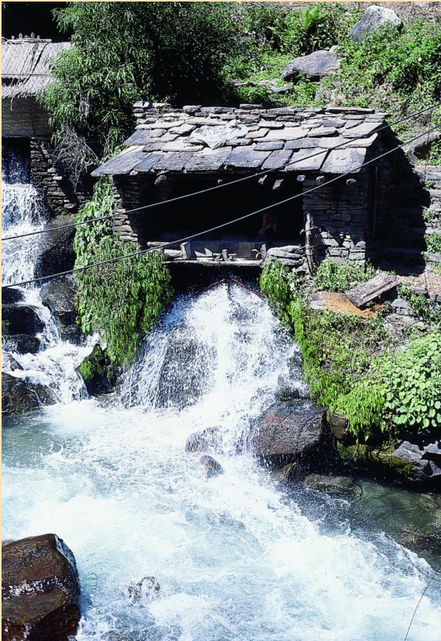
FIGURE 1 Nepal's rich mountain water resources make small hydels of this sort possible. Such plants are used to produce power in remote valleys for small-scale industry.

Nepal might be able to control forest degradation by adopting a differentiated approach to hydropower development. The prospects and the risks of such development are discussed here, and three scenarios that have received increasing attention in recent years are presented for implementation in a wider South Asian context.