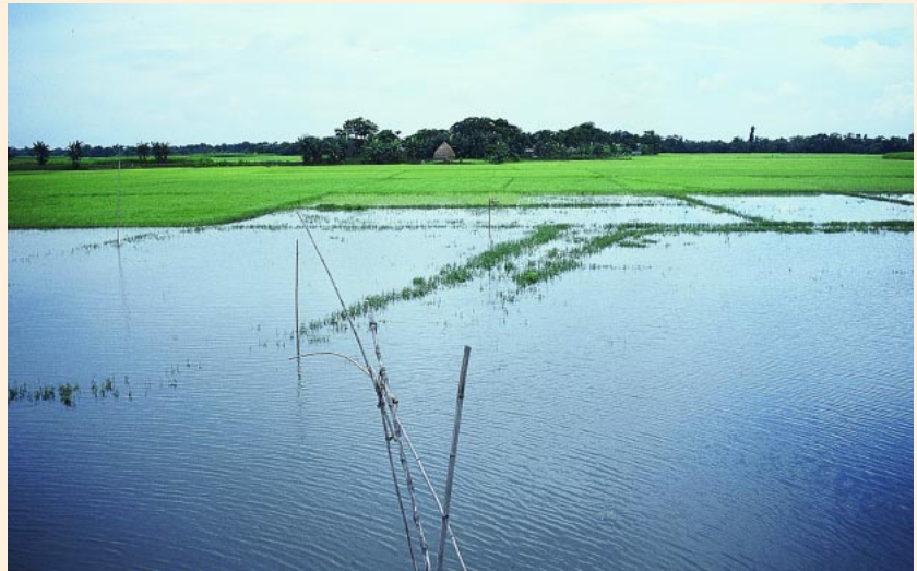
FIGURE 5 Flooded fields in the Brahmaputra/Jamuna flood plain in Bangladesh. Recent studies have shown that dams constructed in Nepal have little effect in preventing such floods.

also generate new markets for other electricity-generating utilities.