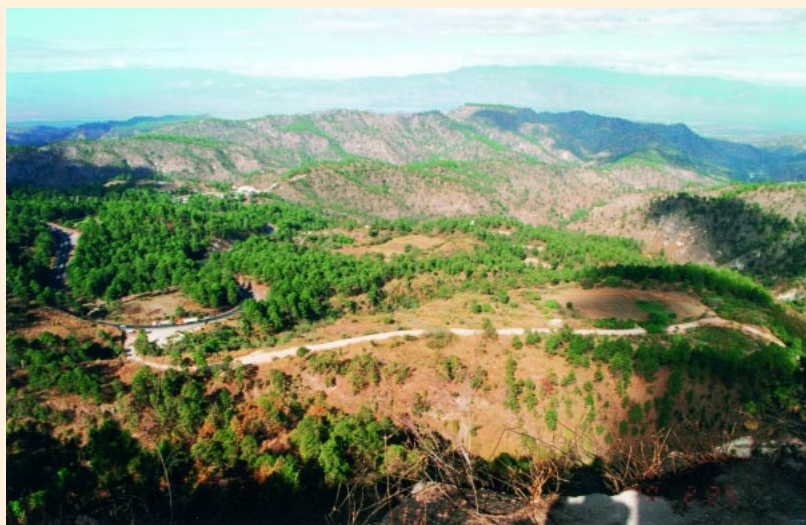
FIGURE 3 View of the El Cajon watershed, which is dominated by pine forests.

true for the input volume, which was three times higher than the value calculated with the dates for Fifi but still well below the maximum tolerable value.