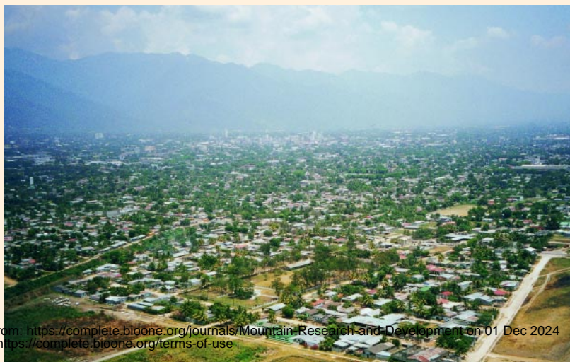
FIGURE 4 View of the Sula Valley 1½ years after Hurricane Mitch, showing the city of San Pedro Sula in the background. The densely settled valley was directly in the path of the discharge that flowed down the Comayagua River in the wake of the hurricane.

of 2600 million m 3 , as much as 2000 million m 3 of water must have flowed out of the lake during the hurricane (Table 2). This figure can be closely correlated with the volume of water reported by the energy authorities to have left the dam. It can thus be stated with some degree of certainty that about 25% of the total discharge volume during the hurricane was retained by the reservoir while over 75% flowed down the Comayagua River into the densely populated Sula Valley (Figure 4). More important than this seemingly limited effect of El Cajon was the great reduction of peak discharge effected by the lake. While peak discharges into the reservoir reached over 7000 m 3 /s, maximum discharge from the lake never exceeded 1400 m 3 /s. This corresponds to a reduction of 80%.