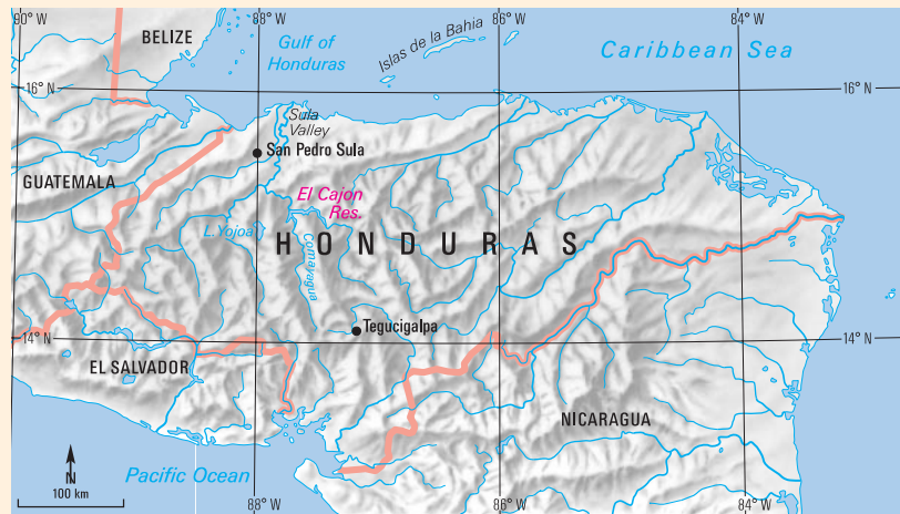
FIGURE 2 Map of Honduras, showing the location of El Cajon Reservoir and the city of San Pedro Sula at the edge of an extensive lowland area. (Map by Andreas Brodbeck)

Fortunately, total rainfall during Mitch was less extensive in the central part of Honduras where the El Cajon watershed (Figure 3) is located. Total precipitation was between 400 and 600 mm, compared with approximately 1000 mm in the north and as much as 1600 mm in the south. Nevertheless, these 400–600 mm constituted an extraordinary event for the El Cajon area, representing about half its total annual rainfall. The year 1998 had been a dry year before Mitch struck in October. This was the reason why the