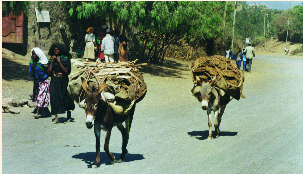
FIGURE 4 Dung is a marketable commodity and is used domestically as a substitute for firewood instead of being spread as fertilizer to compensate for soil nutrient depletion.

“We used to have community rules that governed land use and even helped to protect trees and water resources. That was before the Derg (communist regime) and democracy.” (Abraham Eidy, an Ethiopian farmer)