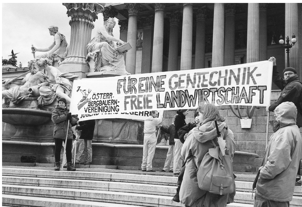
FIGURE 2 Organic farmers and concerned environmentalists from all over Austria gathered in spring 1997 to demonstrate against the use of GMOs in agriculture. This demonstration launched a petition campaign to hold a referendum on the use of GMOs in Austrian agriculture. Over 1 million citizens (ie, over 15% of the population) signed this petition.

and discusses establishment of GMO-free regions as an alternative option for technology development.