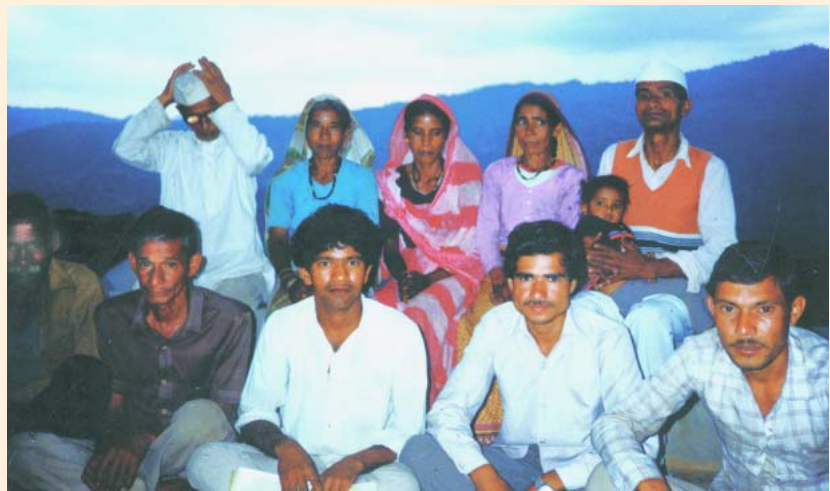
FIGURE 1 Members of a Forest Council in Ranikhet Development Block, Kumaon.

The governmentalization of communities went hand in hand with the creation of regulatory communities. This is perhaps the most critical aspect of any program of environmental decentralization. Lower level units in a territorial-administrative hierarchy, such as the forest councils, are granted powers of governance from a central authority. But in turn they are required to regulate the actions of their members—the common villagers—