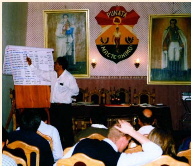
FIGURE 2 The president of the Monitoring Committee ( Comité de Vigilancia ) in Pumata explains how to undertake social monitoring of resources for public participation.

equal rights and duties regardless of size. They are granted competence in specific areas and full authority (arising from election by universal suffrage) to execute this competence. Two smooth elections have been held since the LPP came into force.