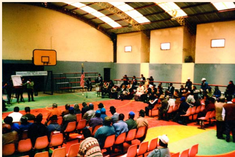
FIGURE 3 Participatory planning in Pucarani is directed by the president of the Monitoring Committee.

Pucarani is organized into rural communities and divided into major and minor agricultural syndicates; original indigenous Andean forms of organization have been lost. The syndicate form of