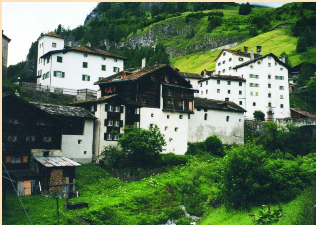
FIGURE 1 Long-settled alpine villages such as Mesocco in the Grisons reflect local cultural development and are also a point of attraction for the tourism industry.

simply a quick thrill? Should they be seen as a habitat and a cultural landscape or a global model for sustainable development? Depending on the personal point of view of the observer or of the people who inhabit the Alps, they may be all or only one of these things.