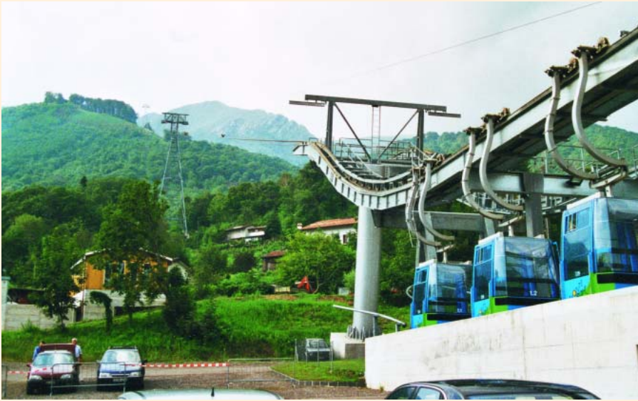
FIGURE 4 The Monte Lema aerial cableway in the Canton of Ticino, Switzerland, in the southern part of the Alps. Tourism is a major source of jobs and has prevented out-migration, especially in poorer alpine regions.

services under the pressures brought about by a liberalized economy. Without such services, the Alps will once again become an area of out-migration, as they were in the years following the Second World War.