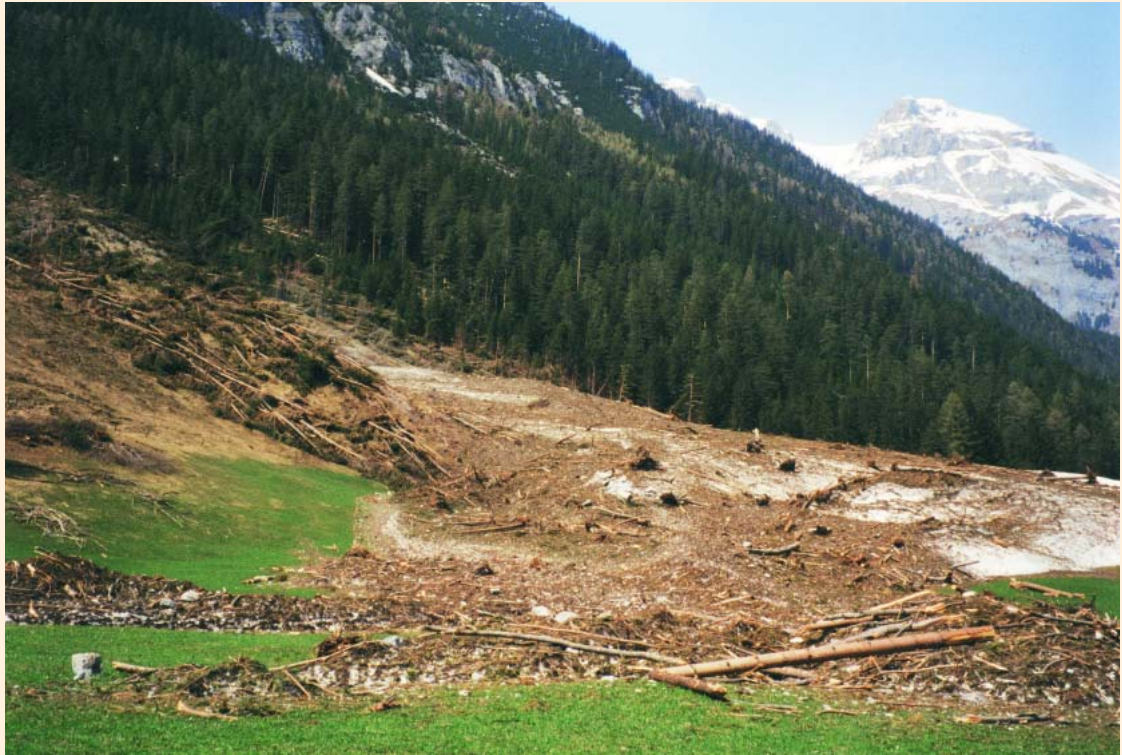
FIGURE 2 Protective forests in the Alps serve crucial environmental functions, but they are not always immune to the forces of nature (eg, as in the case of Goms in the Valais, shown here).

Local and regional processes thus become complete. It is too often forgotten that local and regional markets in the Alps have great potential, that the alpine ecosystem is unique, and that different ethnic groups perform major cultural services in the Alps (Figure 1).