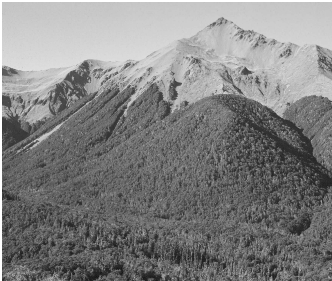
FIGURE 2 Mountain forest on middle and lower slopes with subalpine communities above treeline and avalanche runs extending through the forest, Lewis Pass, South Island, New Zealand.