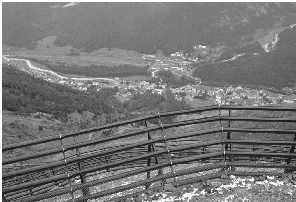
FIGURE 1 Avalanche fences above Pontresina in the Engadin (Grisons), Switzerland. These iron fences hold snow back, thus protecting against a dangerous mountain hazard.

cattle, sheep, and goat pasturing. It provided the basis for projects partly within the zone where subsidized engineering structures had been set up to provide protection from natural hazards and required replanting of damaged forest areas within 3 years of a natural calamity. Under the undisputed assumptions of a forest's capacity to protect inhabited areas downstream, the law made it possible to subsidize the building of access roads for forest owners as well as the construction of protective structures against avalanches, rockfalls, and soil movement in steep upland catchments. The law required maintenance of totally forested areas and was extremely restrictive with regard to clear-cutting and consequential changes in land use. Consequently, clear-cutting for highways and railroads was undertaken as closely as possible to already cleared areas.