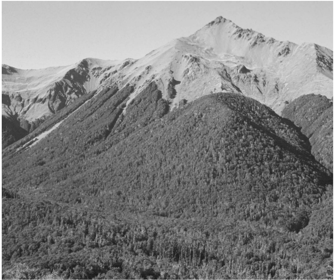
FIGURE 2 Mountain forest on middle and lower slopes with subalpine communities above treeline and avalanche runs extending through the forest, Lewis Pass, South Island, New Zealand.