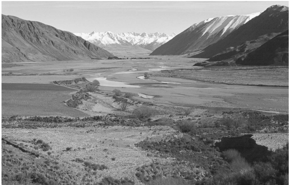
FIGURE 3 Upper reaches of the Rangitata River, South Island, New Zealand, looking westward from Erewhon to the Main Divide and showing mountain forests on steep south-facing slopes, dense shrub communities on steep north-facing slopes, cultivated pastures of introduced species for winter feed on high river terraces, tussock grassland and low shrubby vegetation on fluvio-glacial deposits along the valley floor, scree aprons extending from the mountain slopes to the current river course, and bare flood plain gravels flanking the river.

From the air, an area of native forest may look relatively healthy, but on the ground, it can be another story; the forest floor may have been stripped bare of woody plant seedlings and ground layer plants and the topsoil eroded. There are now more opossums than sheep in New Zealand, and most live in wooded areas.