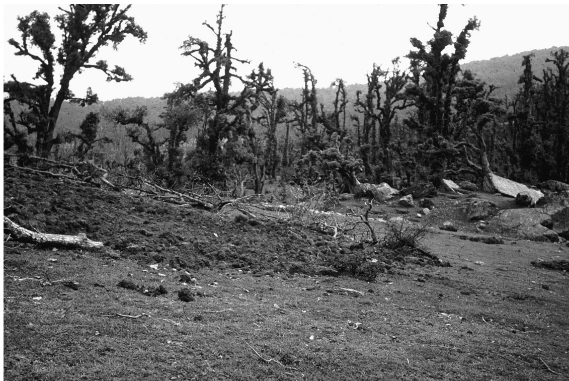
FIGURE 2 Trees in forests are heavily lopped, resulting in conversion of dense to open forests over time. The photo shows heavily lopped oak trees ( Quercus leucotrichophora ) and expansion of cultivation in an open area.