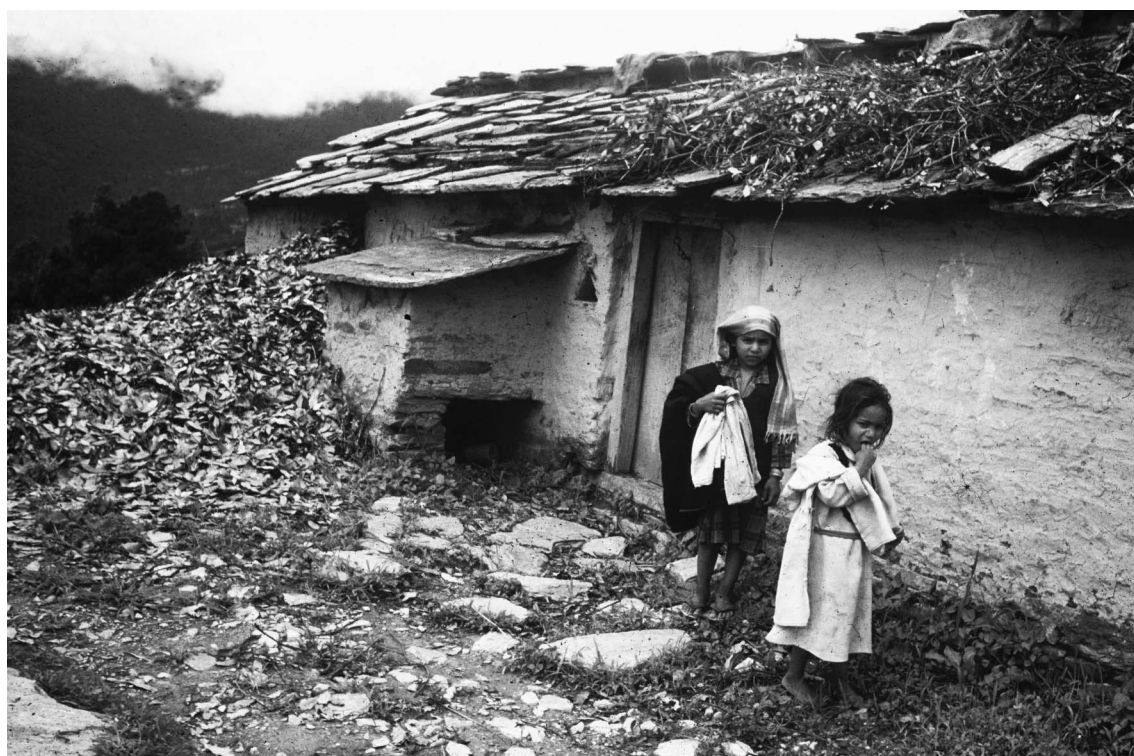
FIGURE 3 A heap of manure outside a livestock shed. Leaf litter from the forest is used as bedding material in such sheds, and the mixture of litter and animal excreta is used as manure in fields. Higher manure input to sustain cash crops results in more intense litter removal from forests.

Himalaya), began cultivation of many costly medicinal plants that used to be harvested from the wild, thus generating income without any significant loss of food crop diversity (Maikhuri et al 2000).