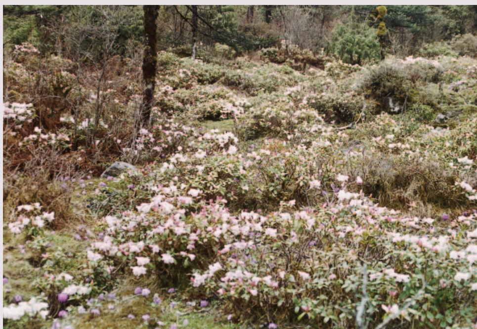
FIGURE 2 Rhododendrons found in the high-altitude zones showing the effect of habitat degradation.

In the last 10 years the population of Sikkim has increased by approximately 33%, thus putting even more pressure on resources. In the fringe areas, livelihood options such as traditional farming, pastoralism, and tourism exist. Agriculture is at the subsistence level, with dependency on natural resources in the surrounding forest exceeding 60%. Fringe areas were characterized by socioeconomic condi-