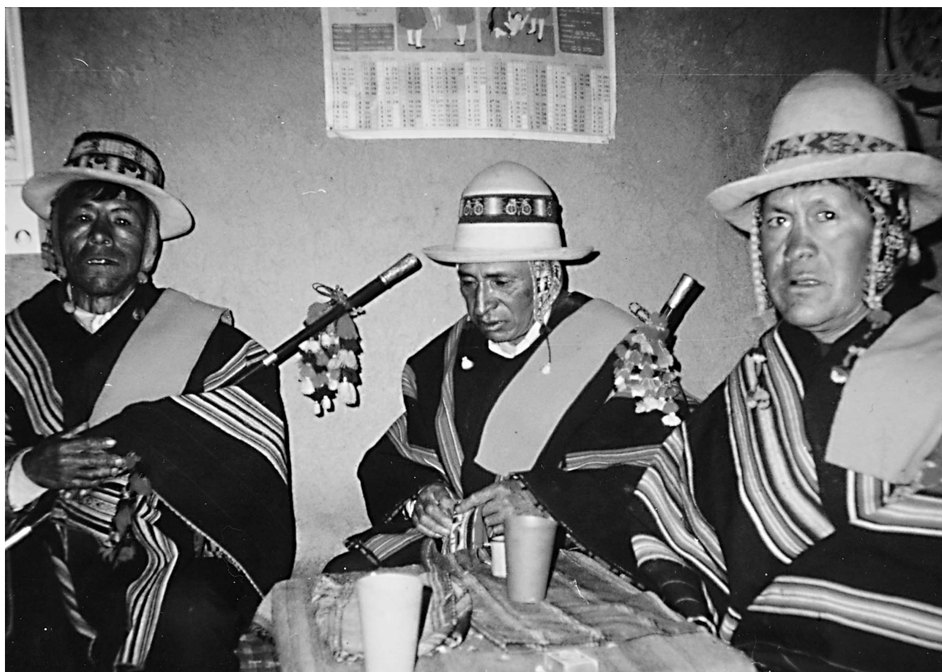
FIGURE 1 The 3 mallkus are the highest authorities of the ayllu . The symbols they wear represent the link between present-day ayllu organization and organization during colonial and precolonial times.

to different periods in the evolution of their land-use system. Using a transdisciplinary approach, the study was part of a process of “accompaniment” of communities based on intercultural dialogue (Rist et al 1999).