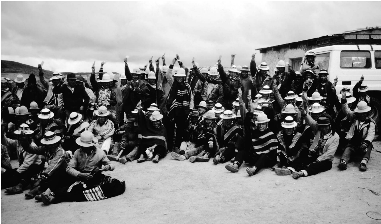
FIGURE 4 During the annual ayllu assembly, authorities representing the traditional ayllu organization and the modern sindicatos participate with equal rights.

Nature, which in turn allowed a reinterpretation of the ecological situation in relation to social and religious–spiritual life. The connecting element between Nature and society is a morally correct action, but in this particular case, acting “correctly” not only means fulfilling a set of defined moral values; it also implies that the community must understand the world according to Andean concepts of life, Nature, and society. This represents a shift from single- to double-loop processes of social learning. Thus, solutions to current problems are essentially perceived as a social and cognitive issue that requires combining deep reflection with an ongoing effort to decode, differentiate, and internalize ethical principles in everyday actions, resulting in an increase of social competencies that permits internally driven transformations of social organization.