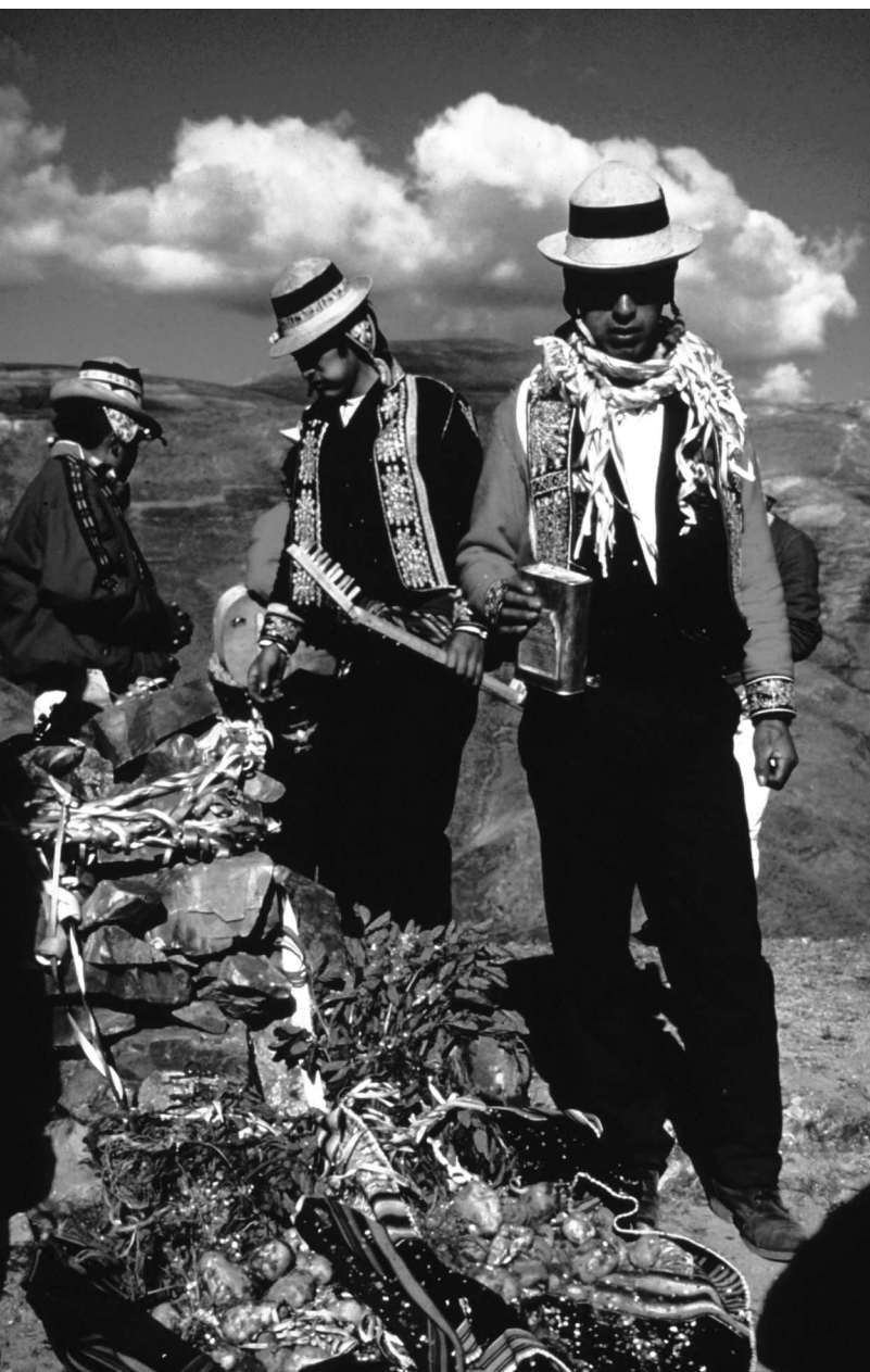
FIGURE 3 The revitalization of rituals dedicated to Pachamama (Earth's mother) was an important element in reintegrating separate groups within the communities.

for example, through increased use of organic fertilizers or shortening of the fallow period on the ayanokas , was perceived as a potential alternative. Meanwhile, other sindicatos advocated privatization of land as a precondition for intensification of land use.