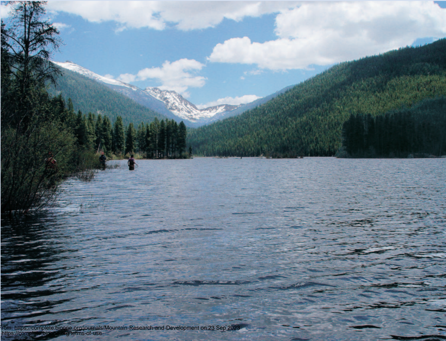
FIGURE 1 Researchers collect freshwater specimens ( Gyraulus parvus and Pisidium casertanum ) at Monarch Lake, west of Rocky Mountain National Park in Colorado.

When collecting new specimens, most researchers are now equipped with handheld Global Positioning System devices and are able to georeference collected data while still in the field (Figure 1). With historical collections data, georeferencing is accomplished retrospectively on the basis of locality information available with most specimens. Typically, initial localities can be located with the assistance of the US Geological Survey's Geographic Names Information System