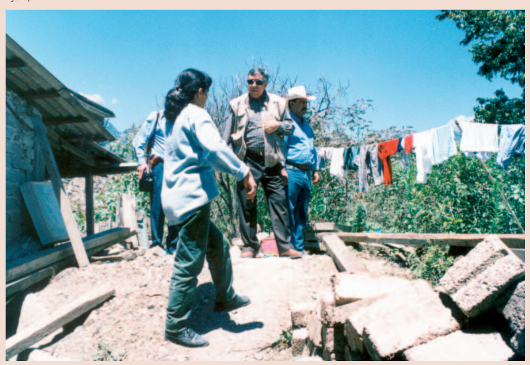
FIGURE 3 Involvement of local actors is a key to development of adequate strategies for disaster prevention. The high level of vulnerability of the local population is also reflected in poor housing conditions.

disaster processes in mountain areas in least favored countries is undoubtedly urgent. On the one hand, there is a lack of scientific research regarding instrumentation, monitoring and modeling in these areas, and a need to better understand the processes themselves, including the potential impact of extreme rainfall events and the role deforestation plays in soil hydrology. On the other hand, considerable further attention is needed to assess the vulnerability levels within communities. When conducting vulnerability research, it is crucial to consider factors such as social, economic, political and cultural issues, which ultimately determine the predisposition of the endangered communities to confront disasters.