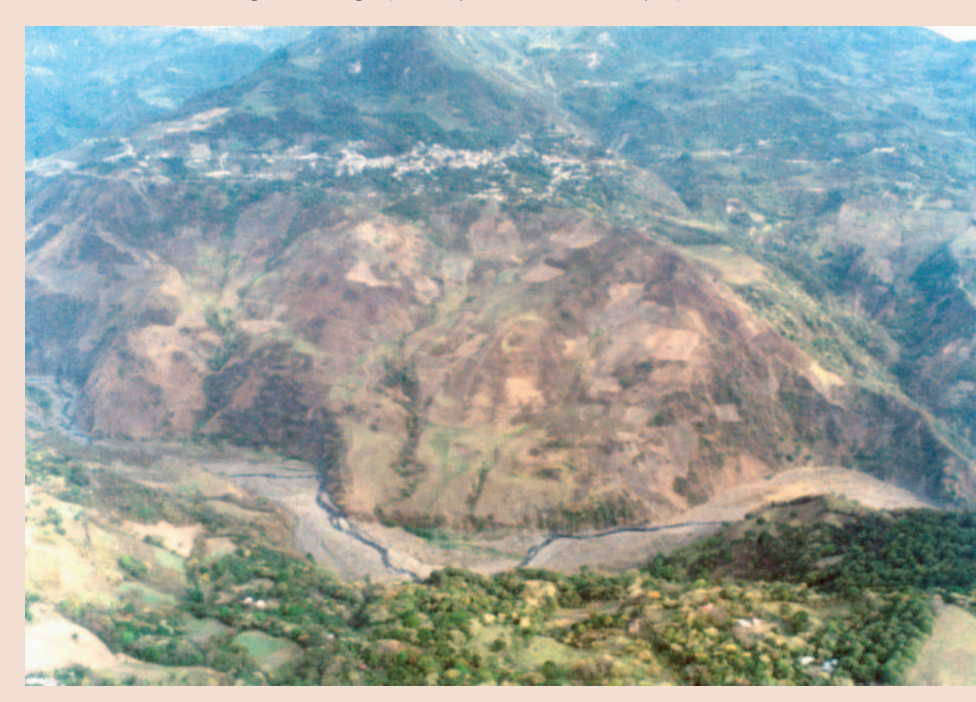
FIGURE 2 Several communities are located on slopes where landslides occurred long ago, and the risk of new landslides occurring remains high.