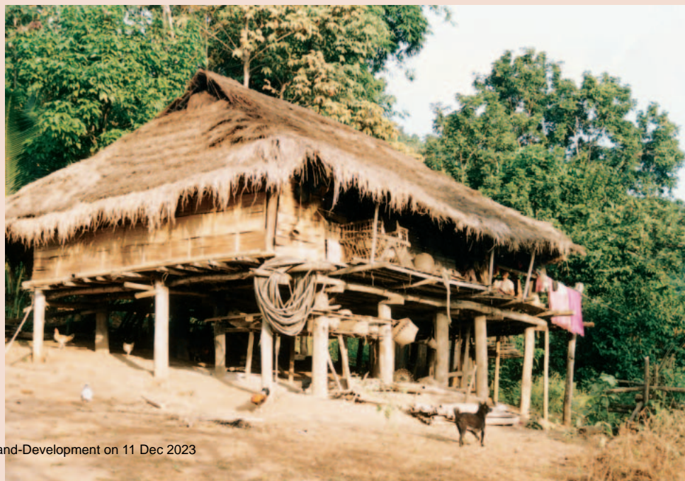
FIGURE 1 A traditional Karen house, Pae Por Highland Development Project.

Both projects aimed to raise the living standards of hill tribe populations by “improving socioeconomic position and self-reliance and progressive integration into the mainstream of Thai society,” as they declared in their project documents. Pae Por Highland Development Project (HDP) was executed by the Department of Local Administration (DOLA) and managed by the 2 District Officers into whose jurisdictions the project fell. At the field level, implementation was centered on 15 “key villages,” each staffed with a 3-person team consisting of a non-formal education