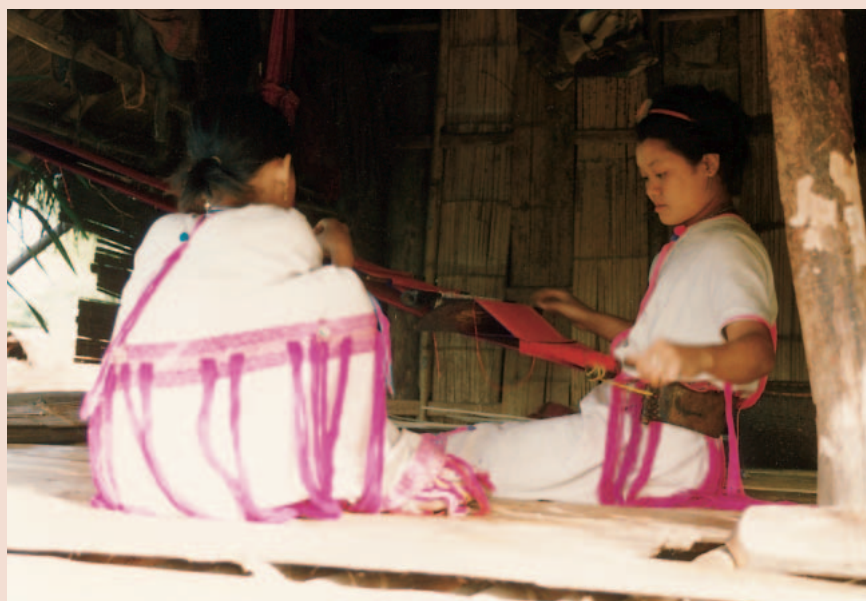
FIGURE 3 Karen women weaving, Tha Song Yang, Pae Por. Neither project paid sufficient attention to traditional economic activities, especially those of women.

ethnic Thais, none speaking any hills language. A range of seeds and some complementary inputs and breeding livestock were distributed, and some temporary increases in production seem likely to have occurred. However, farmers claimed that distribution was arbitrary and inadequate. While new paddy land was to be developed, only 3% of the target of 9000 rai (1440 ha) was met because of limitations of landform and water availability. Although cropping intensities in Wieng Pha were rising and yields falling, little was done to address the need for alternative systems of land management, as the facility's intention to provide research, training and demonstration was never established. The "environmental protection" component in practice consisted of the RFD's reforestation of 1600 ha with Pinus khesia , with villagers participating as laborers. The RFD's policing of land use continued, forcing farmers into practices that they knew to be unsustainable.