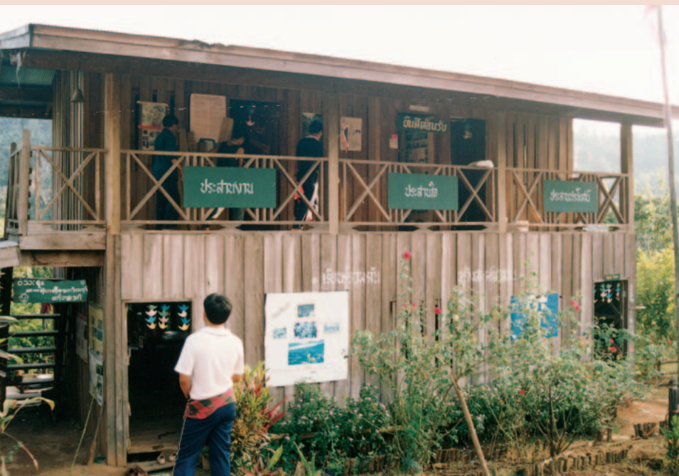
FIGURE 2 A primary health care center, Om Koi—one of the positive outcomes of the Pae Por project.

A substantial number of health facilities and non-formal education centers were established under both projects. In Pae Por HDP, well-equipped schools provided a conducive learning environment for 1500 children—about half of the eligible population—while the number of health centers (Figure 2) was doubled, and staff with hill