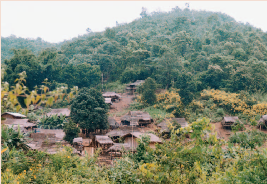
FIGURE 5 The project failed to develop or extend sustainable alternatives for the population's traditional shifting cultivation system. View of Om Koi village, Pae Por.

the forest” was ultimately founded on the threat of the consequences for almost any community or household, were the letter of the law to be enforced.