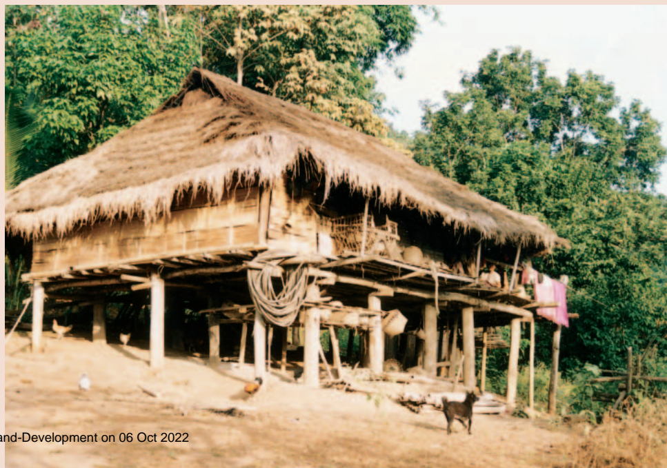
FIGURE 1 A traditional Karen house, Pae Por Highland Development Project.

Both projects aimed to raise the living standards of hill tribe populations by “improving socioeconomic position and self-reliance and progressive integration into the mainstream of Thai society,” as they declared in their project documents. Pae Por Highland Development Project (HDP) was executed by the Department of Local Administration (DOLA) and managed by the 2 District Officers into whose jurisdictions the project fell. At the field level, implementation was centered on 15 “key villages,” each staffed with a 3-person team consisting of a non-formal education