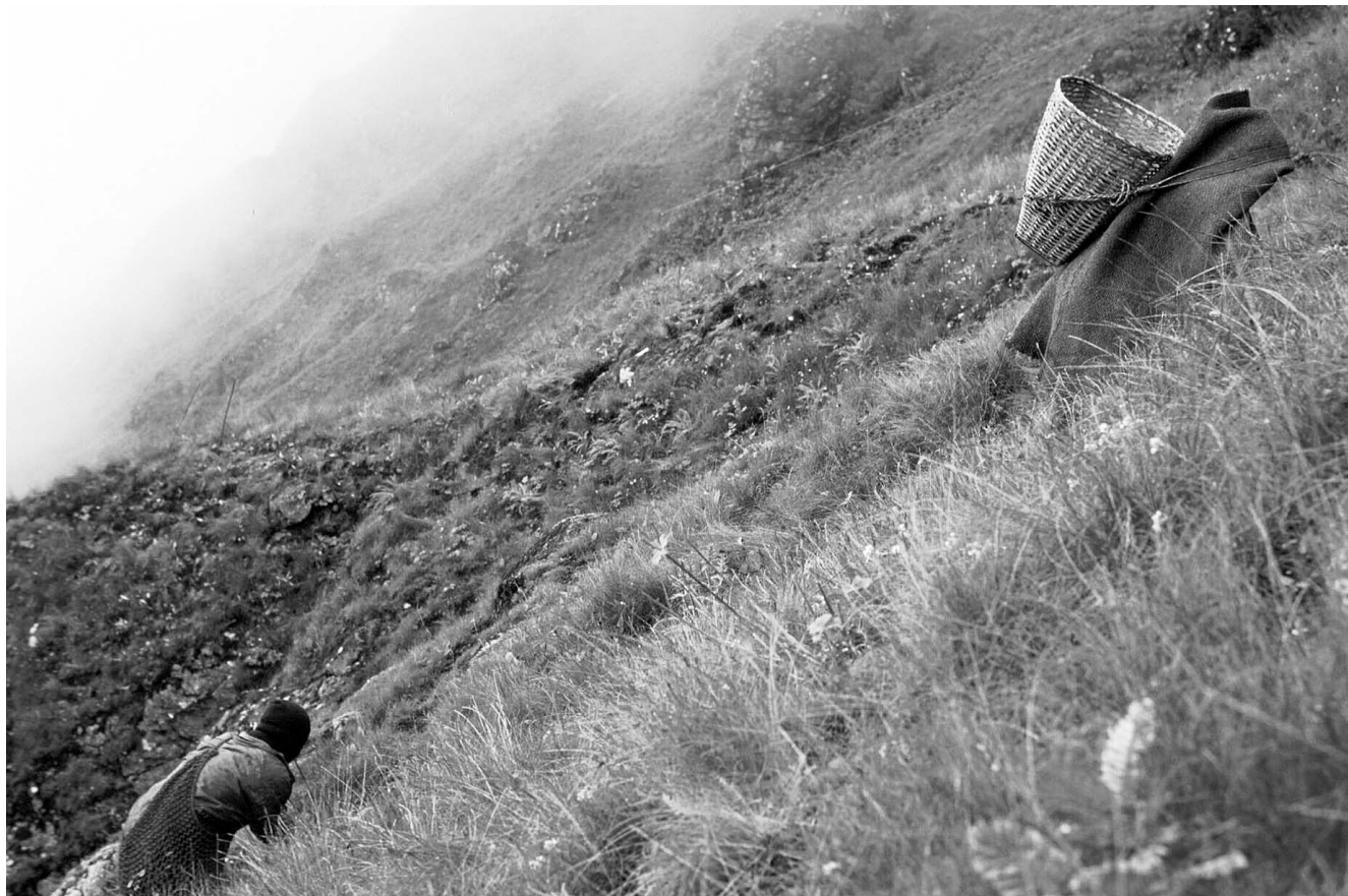
FIGURE 1 Collectors of alpine medicinal and aromatic plants (MAPs) in Gorkha District.

tral development regions of Nepal, and from individuals at the national and international levels in Kathmandu (Figure 2). Overall, 5 categories of stakeholders were identified on the basis of previous studies (Olsen and Helles 1997; Larsen et al 2000):