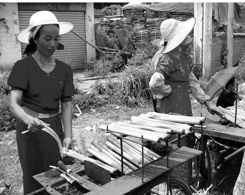
FIGURE 3 Dai women cooking rice in Cephalostachyum pergracile containers.

nan's varied environments, which provide excellent growing conditions for bamboo. There are about 75 genera and 1250 bamboo species in the world. Of the nearly 500 species in 40 genera present in China, mostly in the monsoon areas south of the Changjiang River, over 250 bamboo species in 29 genera occur naturally in Yunnan.