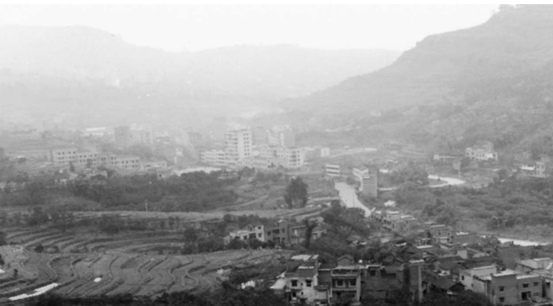
FIGURE 3 Changling Town area today: the village of Lishu, with a non-agricultural population of over 4600.