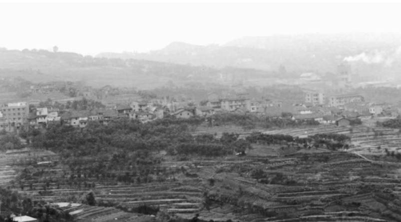
FIGURE 2 Changling Town area in 1994: the village of Fujia, with a non-agricultural population of only 620.

At present, most non-agricultural rural laborers are engaged in trade, services and construction, which require a relatively low level of skills. Laborers in non-agricultural sectors are usually self-employed or do casual work. Only about 20% of the laborers in the non-agricultural sector have stable wage labor. This illustrates that, although laborers are gradually shifting from the agricultural to the non-agricultural sector, employment is still in a period of transition.