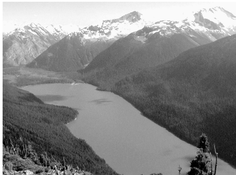
FIGURE 3 Many visitors are motivated to hike along the Musical Bumps Trail to experience the alpine area and scenery, which includes this view from Flute Summit (Site 3) of the surrounding glaciers and Cheakamus Lake.

ioral approach to commercial recreation and tourism settings. This paper has helped to address both of these knowledge gaps. The findings presented here, however, are limited to a single alpine ski area and may not generalize to all ski areas where chairlifts operate in the summer. The applicability of these findings to other ski areas and commercial recreation and tourism settings remains a topic for further empirical investigation.