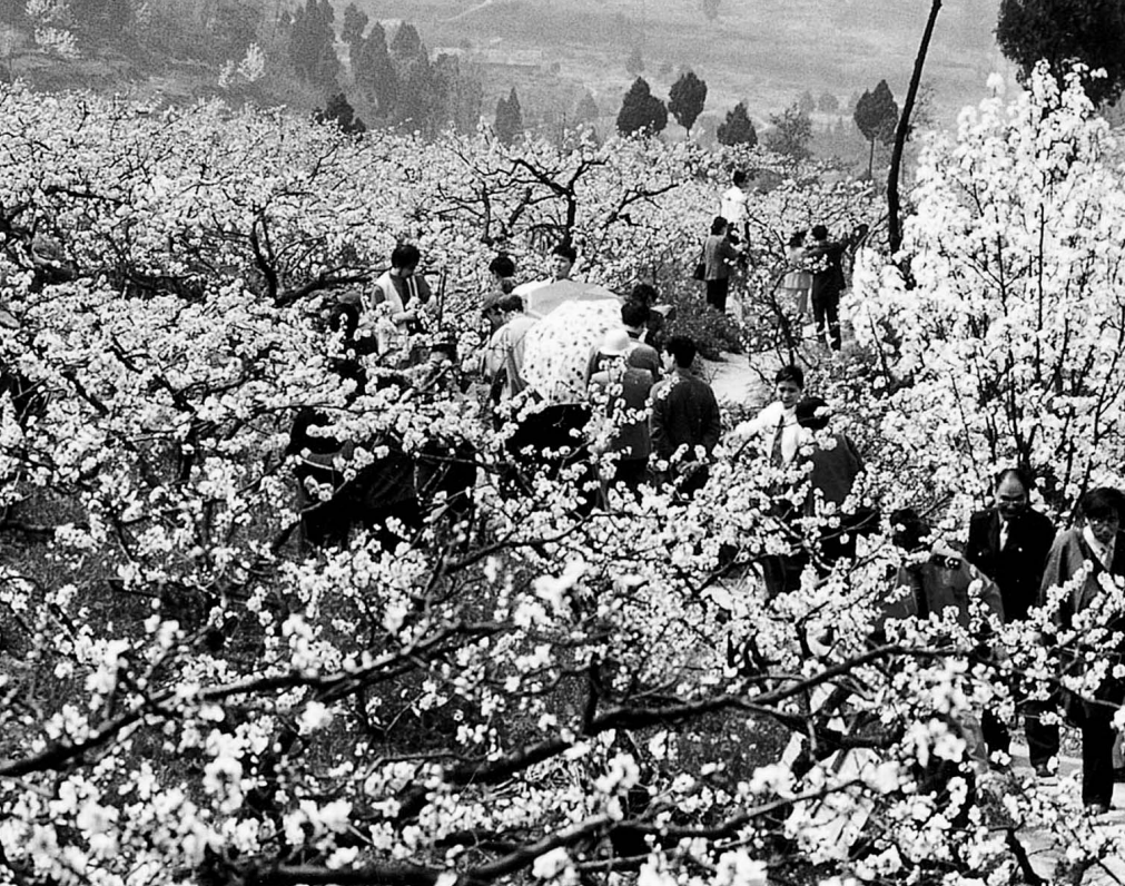
FIGURE 2 Urban visitors pour into Longquanyi County during the peach blossom season.

Rural tourism began as family businesses run by local farmers. Most employees are relatives. Local farmers usually manage several businesses concurrently. For example, besides tourism, they may also grow plants in nurseries, fruit trees in orchards, and run other agricultural operations. With the development of rural tourism, some local urban residents began to operate businesses by renting land from local farmers. It is estimated that about 20% of the operators are not local farmers in Chengdu. Generally their operations are larger and their facilities better than those of the local farmers.