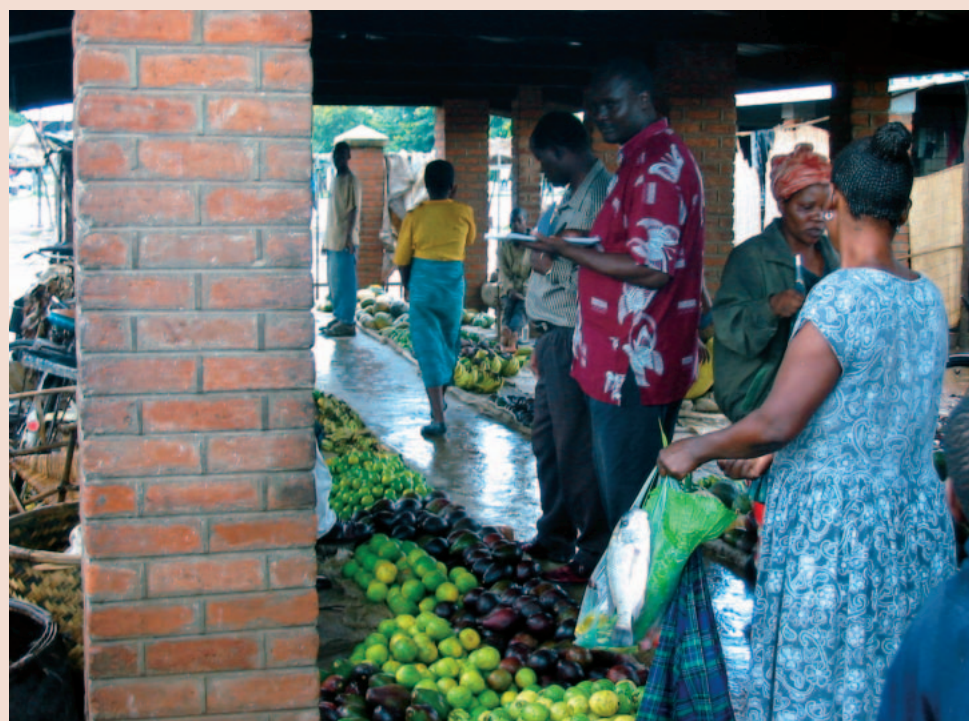
FIGURE 2 A market visit in Salima, Malawi.

To be competitive, farmers need new knowledge, information, innovation and skills that allow them to sustain more intensive, market-oriented production and overcome production constraints. Experimentation provides farmers with opportunities to try out a range of options to eliminate constraints in production, adapt them to their situations and circumstances, and build local capacity to find solutions to production problems. Farmer experimentation follows the principles of participatory technology development (PTD), the key to increasing competitiveness and sustainability and reducing risk in new enterprises (Figure 3). This involves testing and evaluating improved crop varieties and livestock breeds, pest and disease management, better soil fertility, livestock management, and other improved agronomic practices.