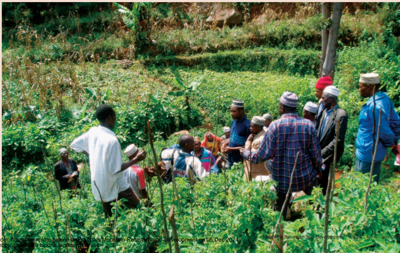
FIGURE 3 Farmers' Research Groups visit their experimentation plots in Lushoto, Tanzania.

There is a risk that market-oriented production may result in the capture of benefits by the rich to the detriment of the poor, or create a privileged group of farmers with access to new markets. There are also concerns that commercializing small-scale agriculture may widen gender inequalities and have negative effects on household food security and nutrition. A proactive gender and equity strategy should encourage and sustain active participation, and cooperation of both men and women in different wealth categories. Efforts geared towards strengthening and building more inclusive and equitable farmers' organizations and other local institutions are needed to foster collective action in production and marketing, and increase economies of scale, efficiency, and the competitiveness of community agroenterprises. Policy advocacy is required to make markets work for poor farmers in marginal mountain areas.