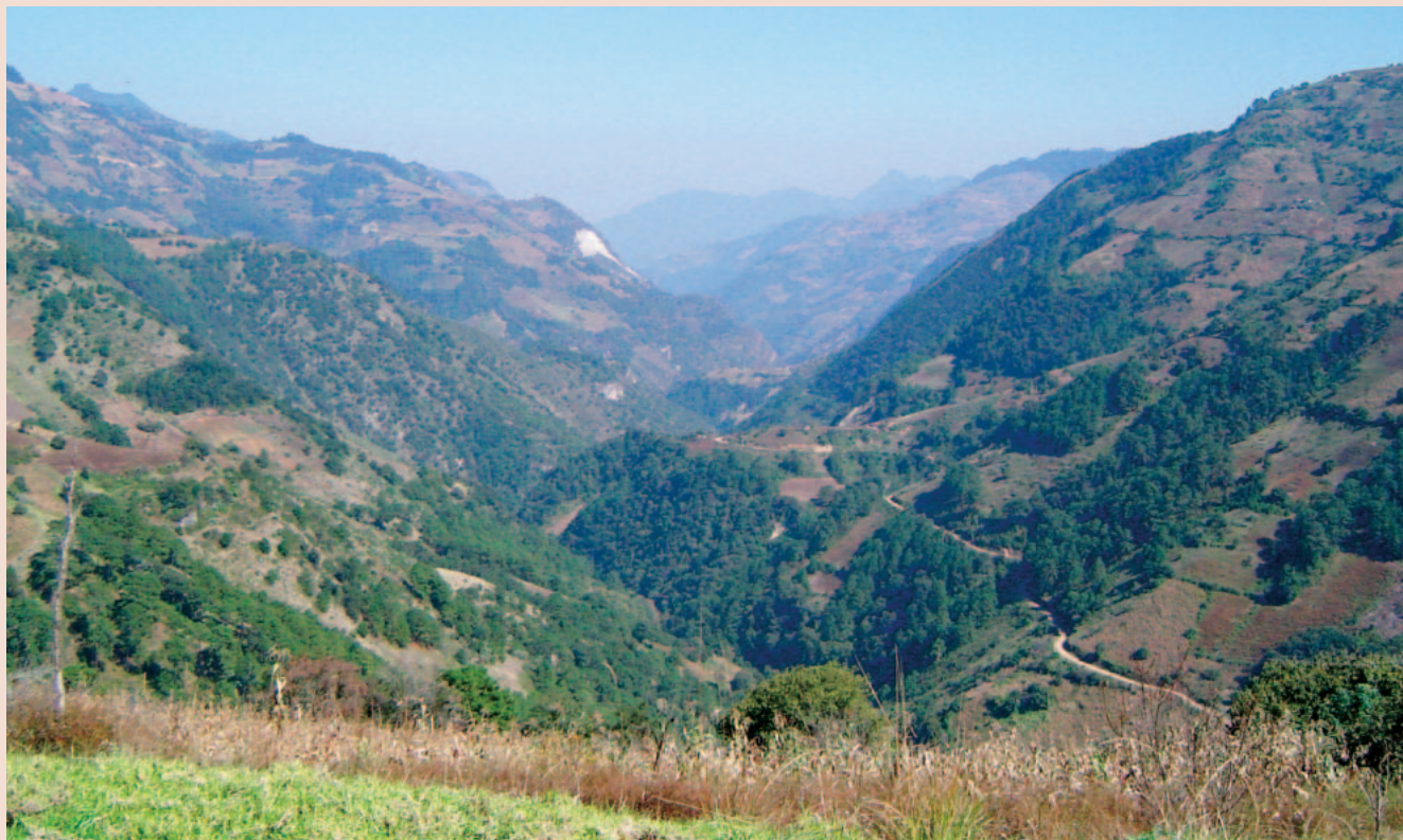
FIGURE 1 View of a valley in the Sierra Norte de Puebla.

In autumn 1999, floods and landslides devastated a mountainous area of Mexico known as Sierra Norte de Puebla. The