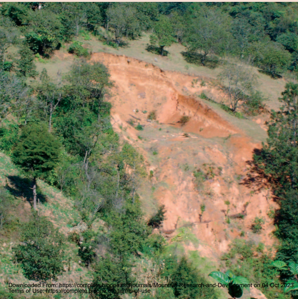
FIGURE 3 Landslides are a common hazard in the Sierra Norte de Puebla.