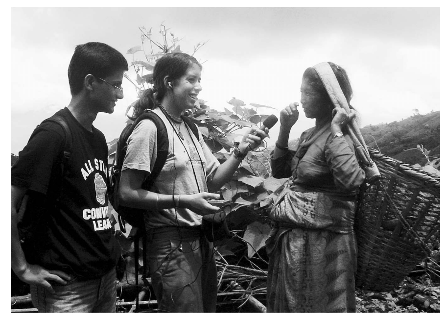
FIGURE 1 Interviewing a Tamang woman. Bhojeni, Kathmandu District, Nepal.

In the first phase, 8 such programs will be produced. As this is a pilot phase, the purpose is to assess whether such an approach—which