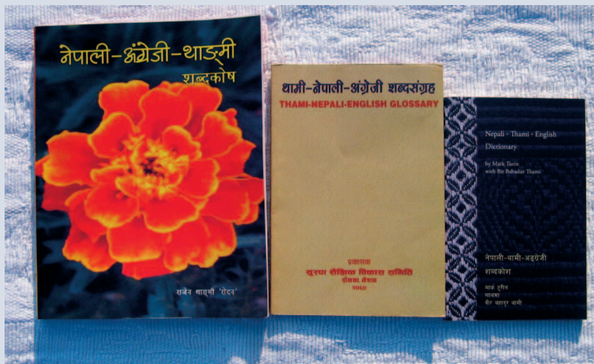
FIGURE 3 Cause for hope: after years of being forgotten by scholars and language activists, the endangered Thangmi language now boasts 3 dictionaries, all of which were published in 2004.

nation state. Ethnic and linguistic differences are also quick to be invoked in times of conflict.