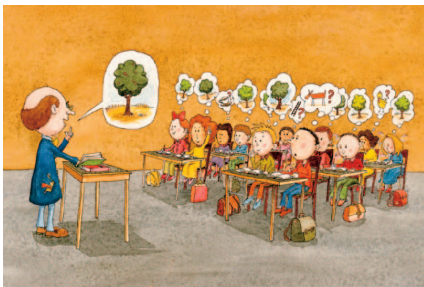
FIGURE 2 Educating Babel: the mother tongue dilemma. While studies show that students learn better through their mother tongue, the language has to be taught in school for the benefits to be reaped, which is rarely the case with minority languages.

This is particularly important because about 476 million of the world's illiterate people speak minority languages and live in countries where children are for the most part not taught in their mother tongue (Figure 2).