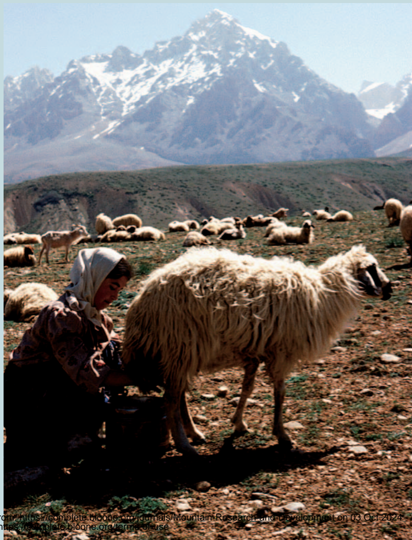
FIGURE 1 Girls in Niğde, in the Taurus Mountains, are forced by their parents to work at home or in the fields instead of going to school.

socioeconomic difficulties work against the basic education of children, especially of girls living in mountainous provinces: