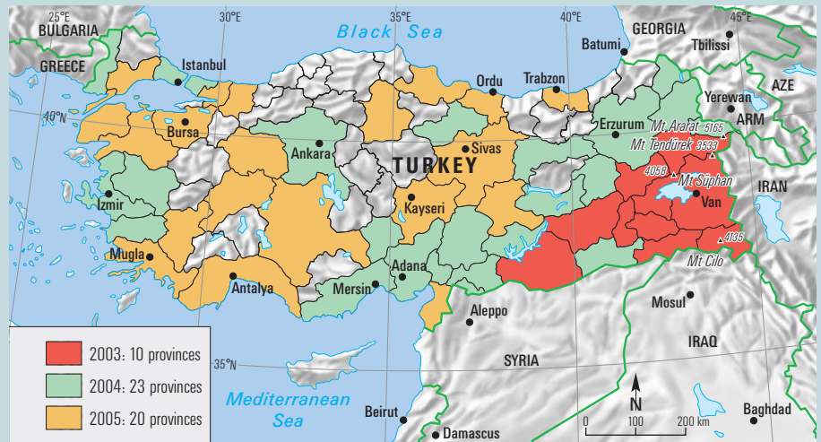
FIGURE 2 Provinces included in the “Off to School, Girls!” campaign, and date of their inclusion. (Map by Mehmet Somuncu and Andreas Brodbeck)

dled at 2 levels: a) The Campaign Central Management Level , at which coordination of the campaign is provided, and the basic decisions are made. The Central Execution Board in the capital city, Ankara, performs this task. b) The Province Implementation Level , which executes activities in the provinces within the scope of the campaign, is comprised of: the boards and commissions established at the level of province, district, village, and town; province consultants; province coordinators; and province and district communication bureaus (Figure 3).