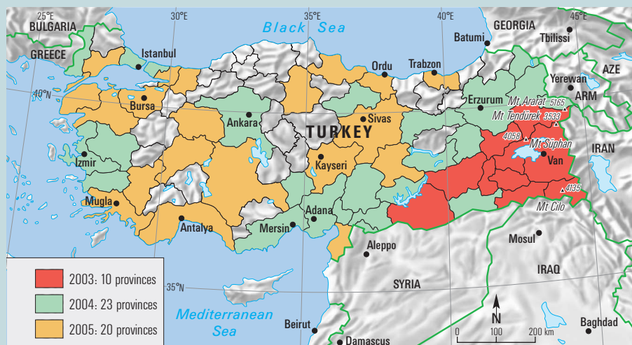
FIGURE 2 Provinces included in the “Off to School, Girls!” campaign, and date of their inclusion. (Map by Mehmet Somuncu and Andreas Brodbeck)

dled at 2 levels: a) The Campaign Central Management Level , at which coordination of the campaign is provided, and the basic decisions are made. The Central Execution Board in the capital city, Ankara, performs this task. b) The Province Implementation Level , which executes activities in the provinces within the scope of the campaign, is comprised of: the boards and commissions established at the level of province, district, village, and town; province consultants; province coordinators; and province and district communication bureaus (Figure 3).