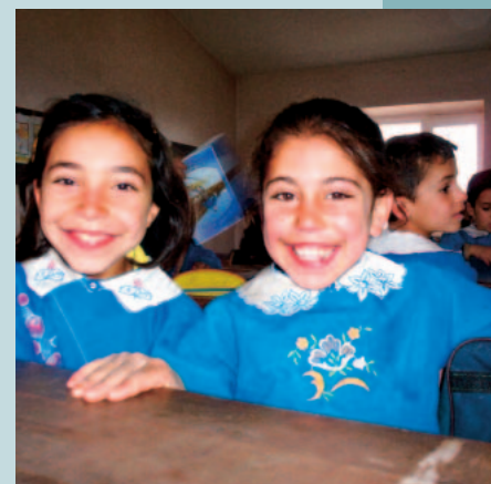
FIGURE 5 Girls and boys enrolled in school as a result of the campaign in Kirkkoyun, Diyarbakır.

Data on the results of the campaign for 2005 will be collected in the Central Coordination Bureau in Ankara by the end of December 2005, and the report will be published in 2006. The goal for 2005 is to enrol 300,000 girls in primary education and ensure that they continue. By 2015, in accordance with the MDGs, Turkey aims to provide primary education to all boys and girls in the country. Turkey has been making every effort to ensure that these children attend school.