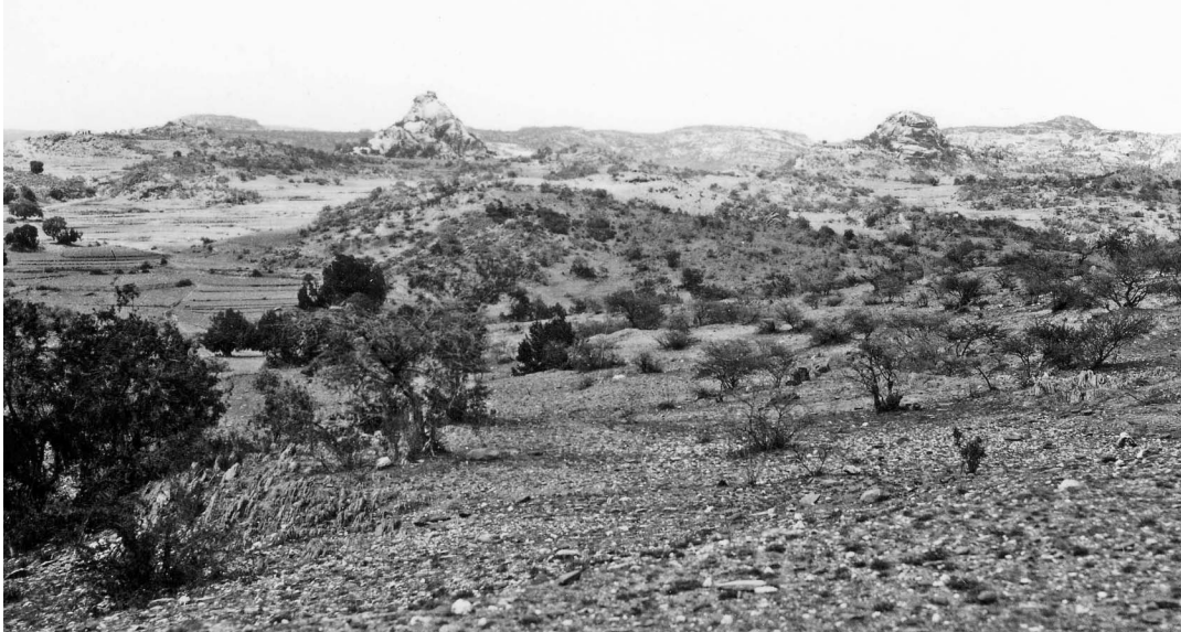
FIGURE 1A April 1930, near Adi Caieh.