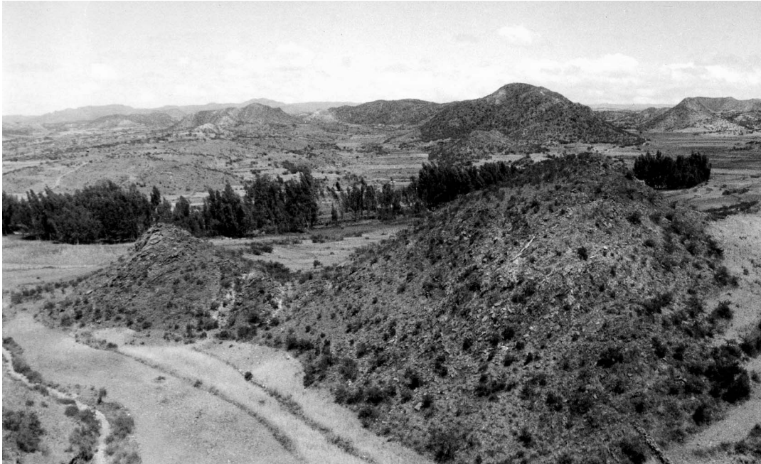
FIGURE 2A March 1971, Adi Cubollo.