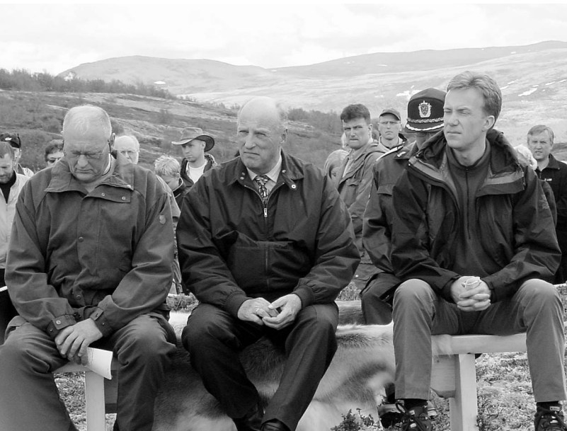
FIGURE 3 The opening of Dovrefjell-Sunnalsfjella National Park in June 2002. From left to right: the mayor of Dovre municipality and leader of Dovre Mountains Council, Erland Løkken; King Harald of Norway; and the Minister of the Environment, Børge Brende.

In the designation process for both Dovrefjell and Geiranger-Herdalen, the actors involved emphasized the importance of broad representation of various stakeholders in the appointed reference groups. This