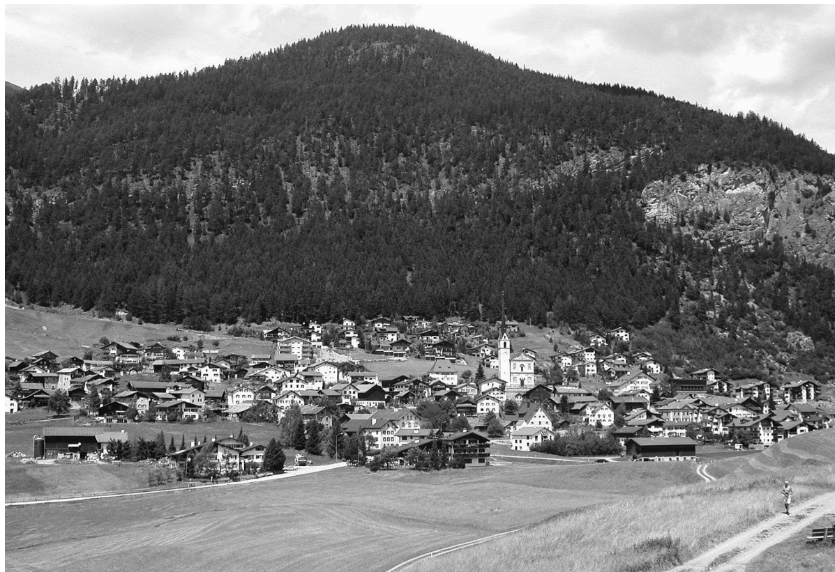
FIGURE 1 The village of Alvaneu, Canton of Grisons, Switzerland.

These studies elucidate that for tourists, visited places can be as deeply meaningful as for locals, notably as symbols of important experiences or because of the places' restorative value. But empirical studies focus mostly on defining the constituents of sense of place, or on the strength of place relations. Stedman's (2003) quantitative study in northern Wisconsin demonstrates that sense of place is not just based on social constructions, but also on some material reality, ie on concrete landscape characteristics. Hay (1998) found in a survey study on Banks Peninsula, New Zealand, that the sense of place of local Maori people is deeply rooted, whereas the sense of place of tourists is rather superficial, due to different residential status and thus different ancestral and cultural connections. Still, no studies have examined the contents and conditions of sense of place, particularly with regard to group differences. Empirical knowledge of differences in sense of place between the 2 main interest groups with respect to Alpine landscape development, locals and tourists, is especially poor.