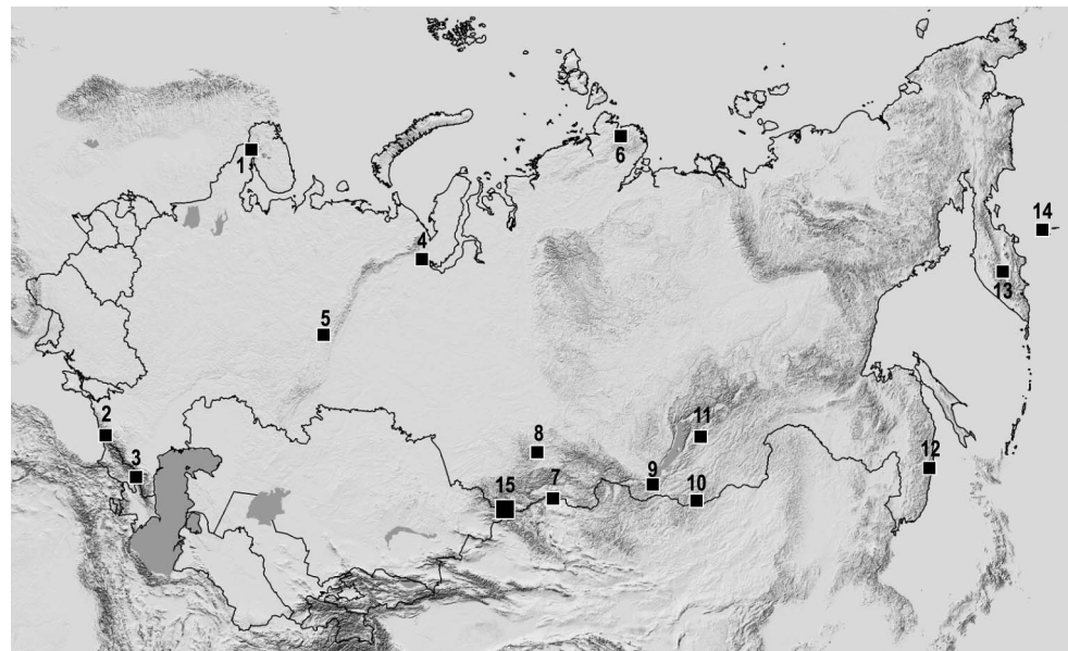
FIGURE 1 Location of the 15 Mountain Biosphere Reserves in the Russian Federation; the boundaries of the New Independent States are visible at the west and southwest of the Russian Federation. (Map by Merzlyakova, adapted by Jürg Krauer and Ulla Gämperli)