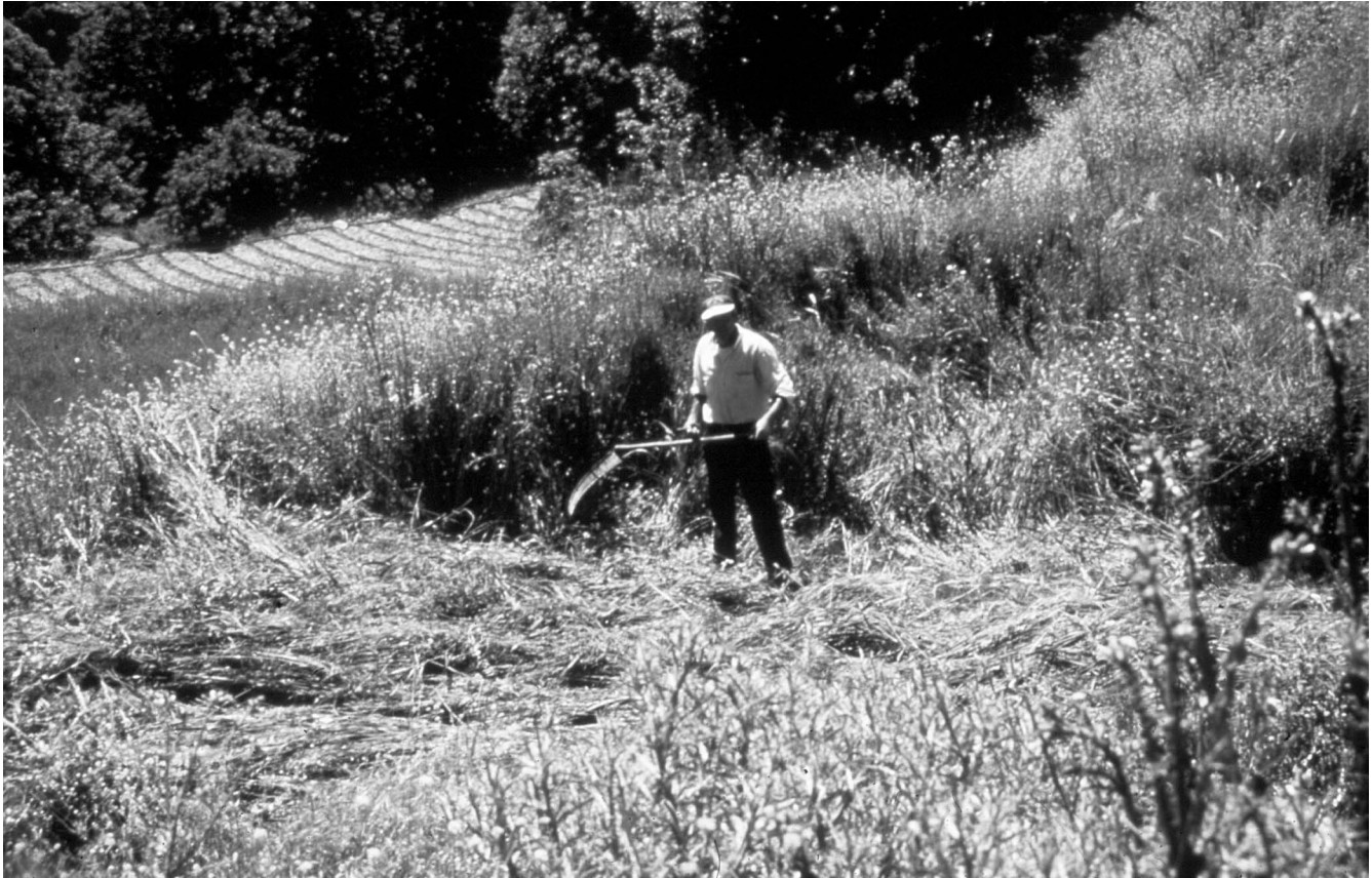
FIGURE 1 Because of the rough orography in the Sierra Nevada and the average age of the population working in the agricultural sector, innovation in the region is quite difficult.

heterogeneity that characterizes the different regions of the Sierra Nevada. This heterogeneity is manifested in the variety of natural resources and in the imbalance in funding for public infrastructure, as well as in the pronounced and faltering relief that characterizes this territory. It is also linked with the uneven population structure and the social, political, and economic stratification that this represents.