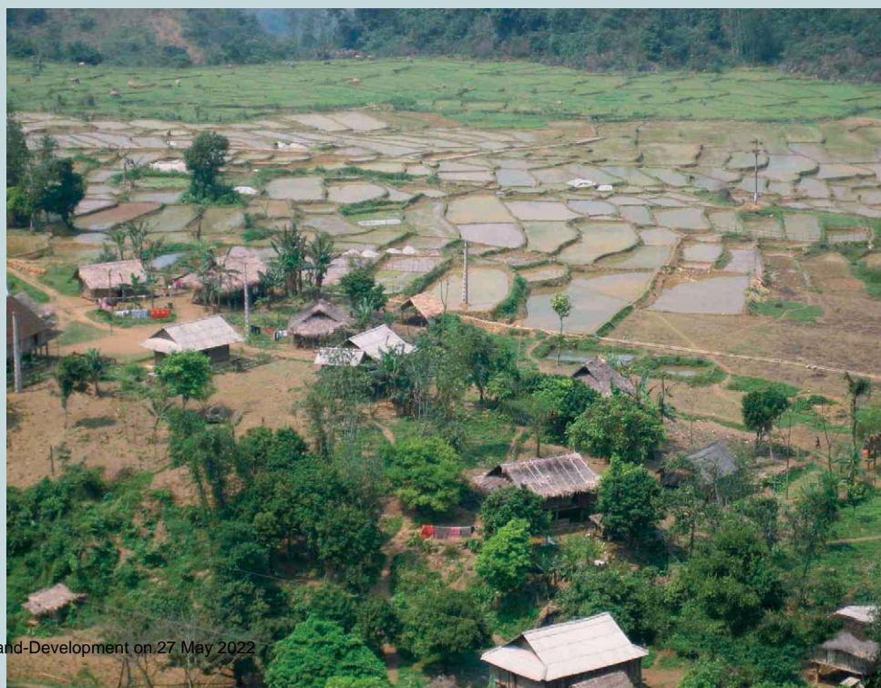
FIGURE 1 Rice paddy cultivation on the floor of the valley, Hoa Binh Province.

Our data suggest that there is a disconnection between official policies and local understanding of the appropriate implementation of land use policies. For example, district officials in Tuong Duong district have allocated land differently from the methods deemed appropriate by the central government. People at the commune and hamlet levels often report that land allocation is incomplete; moreover, farmers are often unaware or have an incomplete understanding of policies implemented at the provincial and district levels. In one commune in Tuong Duong district, for instance, the commune officers report that 4 of 5 hamlets had land allocated in 1998/1999. One hamlet refused to allow the land allocation at that time; instead, land was allocated in 2001/2002, at which time a different allocation system was used by the district officials. Here we should understand the problem that local authorities face due to the many land policies and laws that have been issued over time (1993,