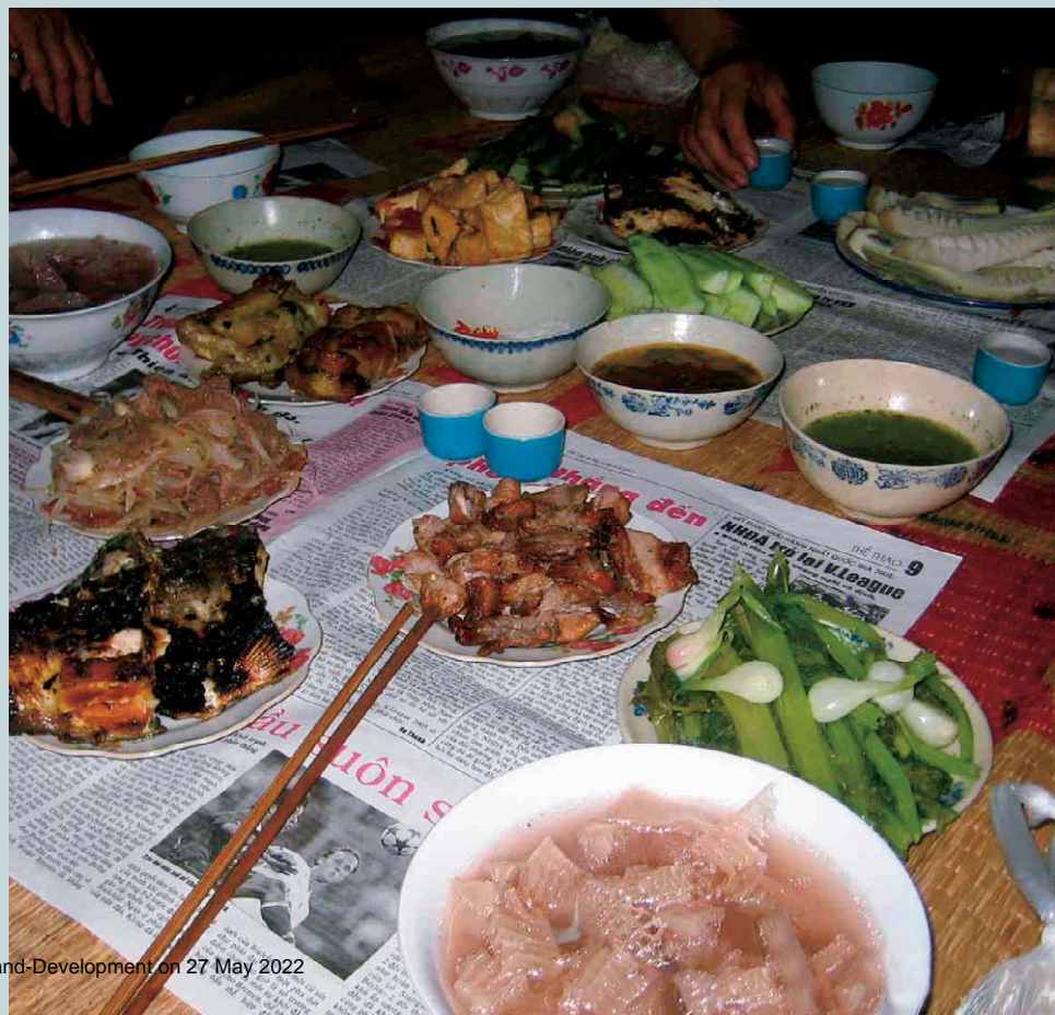
FIGURE 3 Thai meal to welcome visitors to a house in Son La Province: an example of food security increased by CSA.

Swiddening is not the main cause of poverty or environmental degradation in upland Vietnam; rather, it is often a rational way of keeping poverty at bay under difficult circumstances. For a variety of reasons, swidden farmers are generally poor and belong to the most vulnerable groups in Vietnamese society. Changing farming